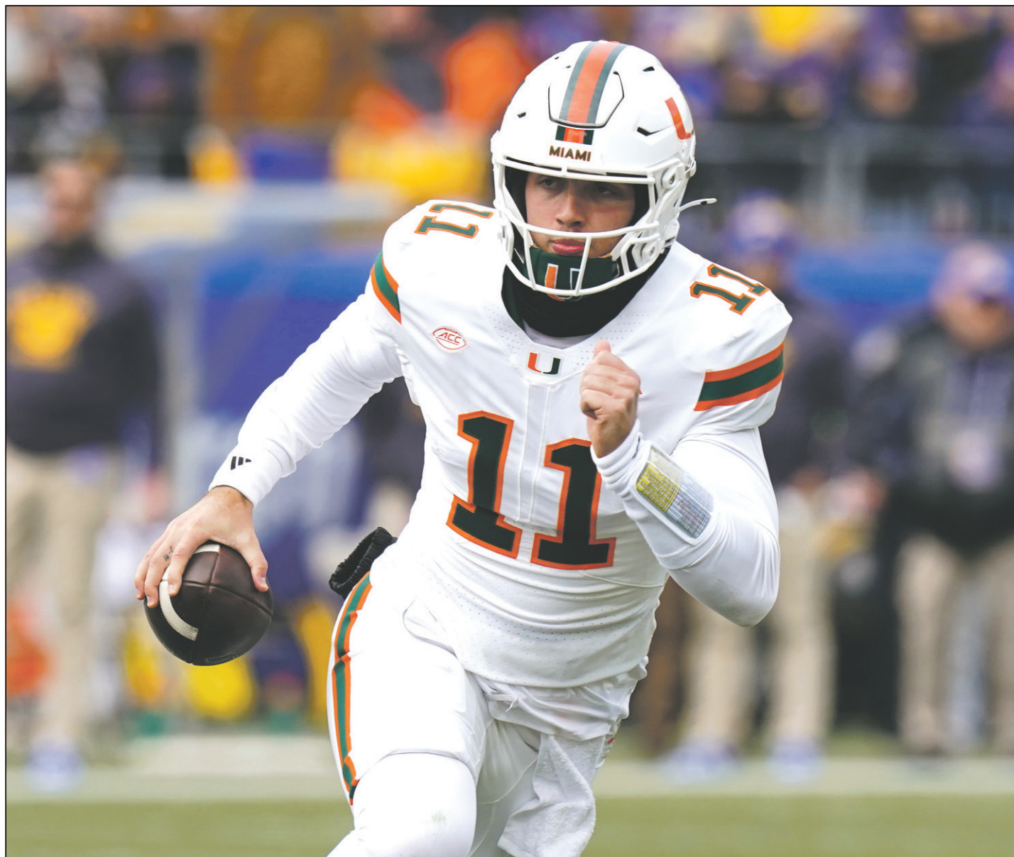
Quarterback Carson Beck has two national championships on his résumé from Georgia and seeks another with Miami.

It's sometimes hard to remember that at this time last year, Beck was facing a most uncertain future. He was preparing for major surgery that would basically rebuild his elbow. He had to decide between entering the NFL draft or picking a new school for this year, since it was no secret that he and Georgia would be parting ways. And when he came to