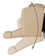
Gliding / rocking function