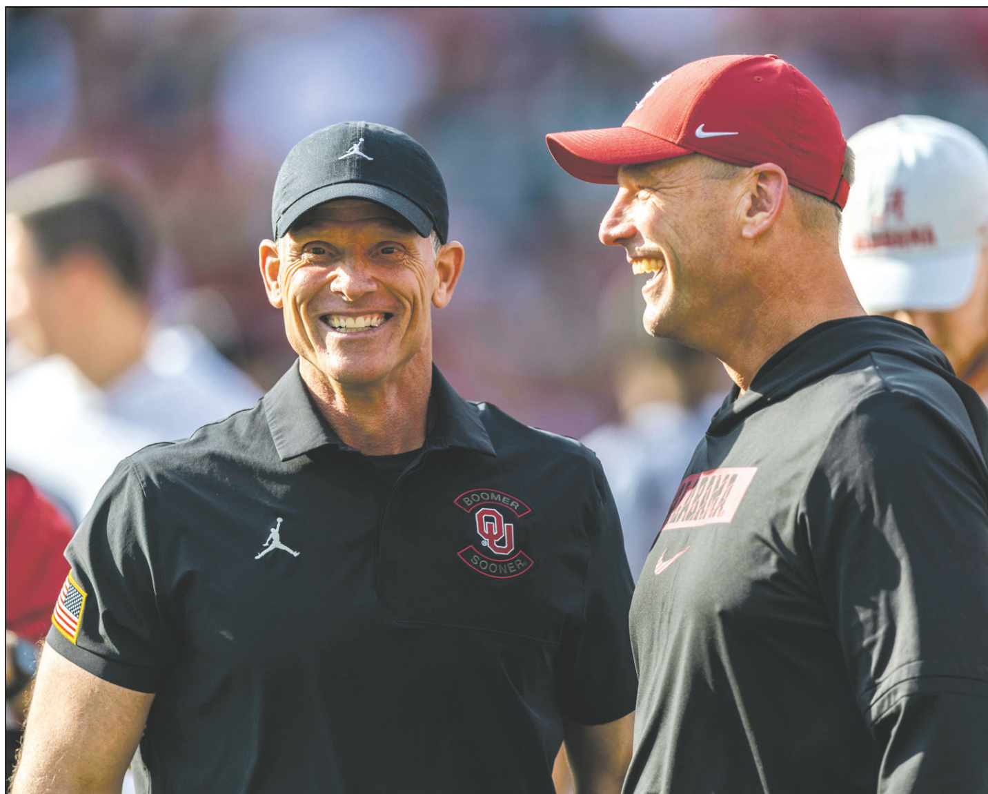
Oklahoma's Brent Venables and Alabama's Kalen DeBoer have dealt with major expectations from fans to lead their teams to playoff berths.

Venables directly addressed the media, some of whom raised questions about his status before the season. He said he embraced doubters.