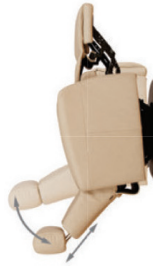
Adjustable head and neck support