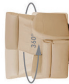
360 swivel on MANUAL - 180 on MOTORIZED

This spaceage material encases the interior steel frame and sinuous springs, allowing for body-friendly curvatures to be covered with glove-fitted upholstery. This guarantees absolute comfort and durability.