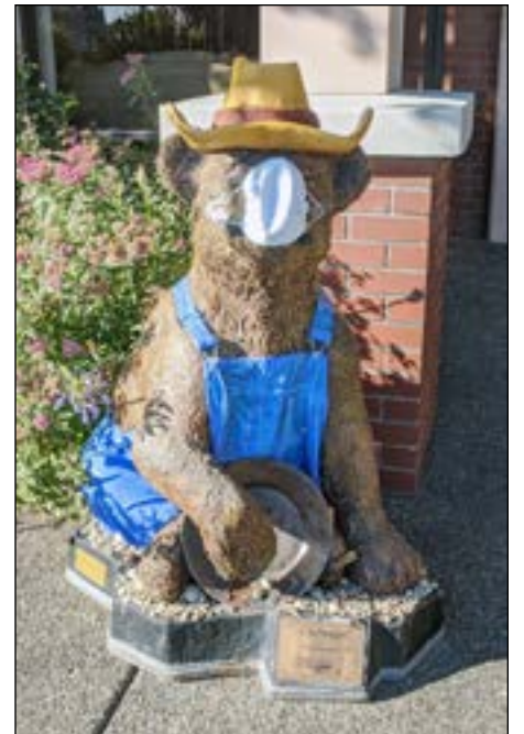
A bear in front of Evergreen Federal Bank in Brookings reminds festival-goers to wear masks when social distancing in't possible.

So, here's to the hard work of the young ladies of the Azalea Court, the dedication of everyone preparing for the parade, and all of those who have stepped up to bring the 81st Azalea Festival together. Let's hope for beautiful weather and a safe weekend for all!