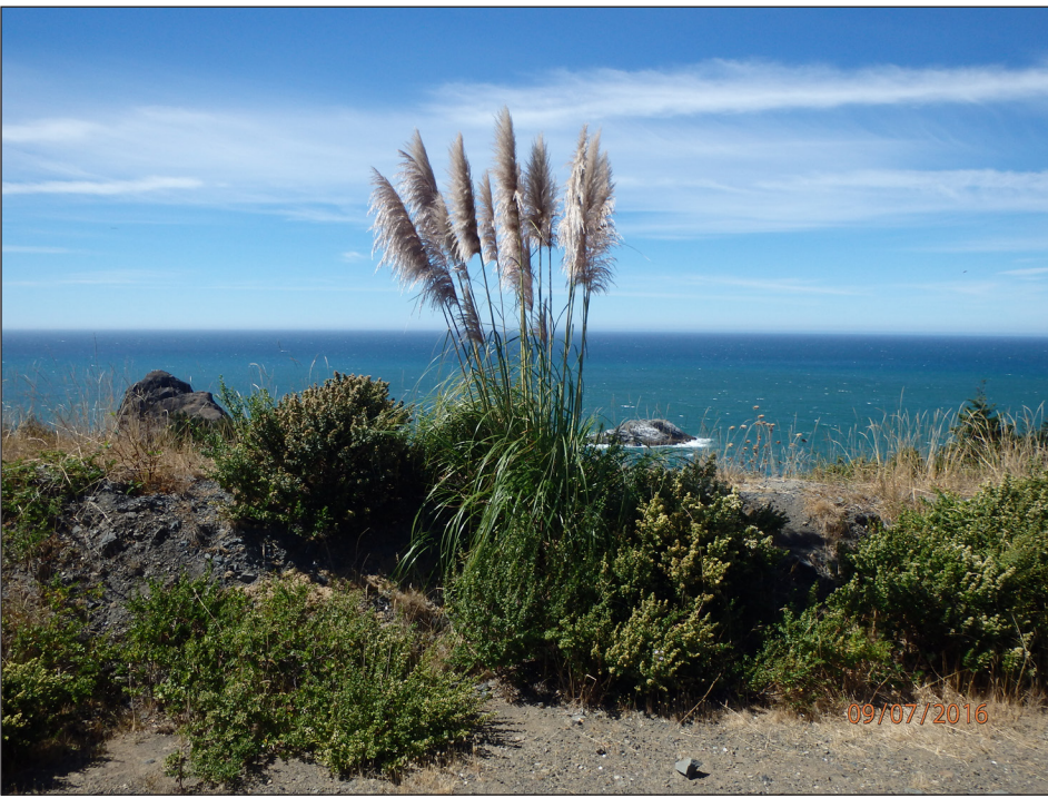
Jubata grass is sometimes confused with pampas grass, but proliferates much more quickly.

The rain and lack of volunteers is threatening our success, says Nature’s Coastal Holiday, which is decorating along U.S. Highway 101 and selected commercial areas in the Brookings Harbor community instead of Azalea Park this year. They have several displays to still set up and need light stringers at the Frontage Road green area by Goodwill at 10 a.m. on Saturday, Nov 21.