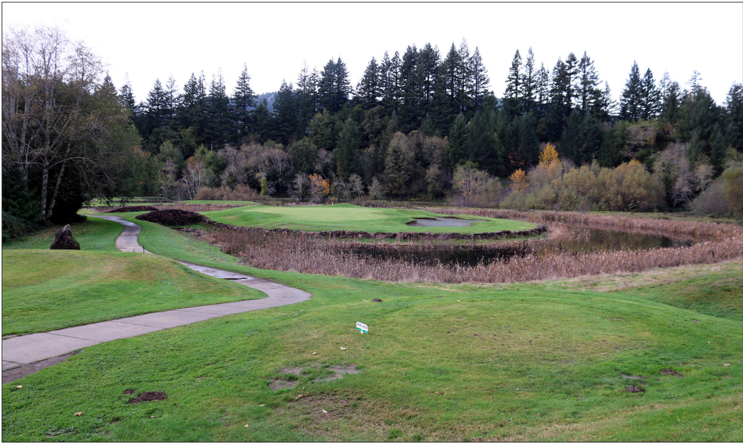
Salmon Run provides unforgettable wildlife viewing opportunities, including salmon, deer and elk, in a beautiful golf setting designed for all skill levels.