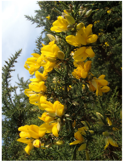
Gorse tops Curry County's most wanted weed list.

Most of the problematic gorse infestations are in the north part of the county with dense infestations. Brookings has a small cluster of problem areas in the Dawson Tract, Harris Creek watershed and the Rainbow Rock area. Other areas of the south county have a few plants. It's about a five-year process to eradicate it.