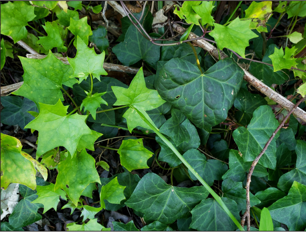
Cape ivy is the brighter green leafed plant that’s intermingled with the darker colored English ivy. Both plants will kill trees, but the English ivy is too ubiquitous to productively target except for restoration projects.

The Japanese and Himalayan knotweeds tend to be in riparian areas and