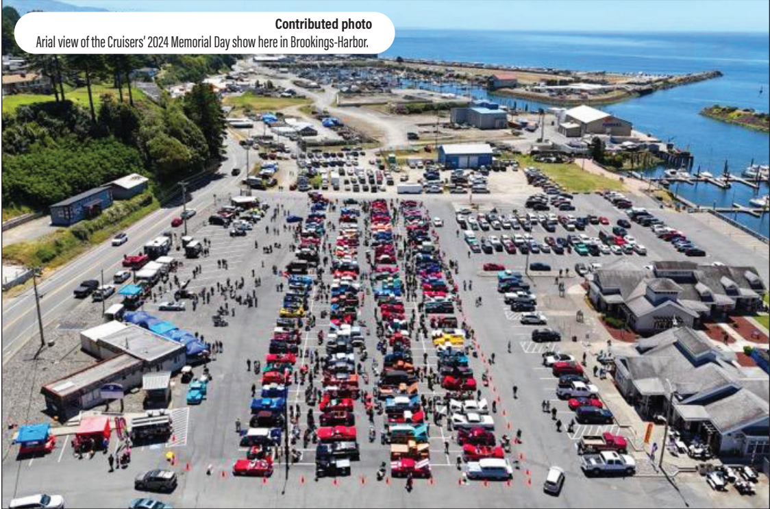
Aerial view of the Cruisers' 2024 Memorial Day show here in Brookings-Harbor.