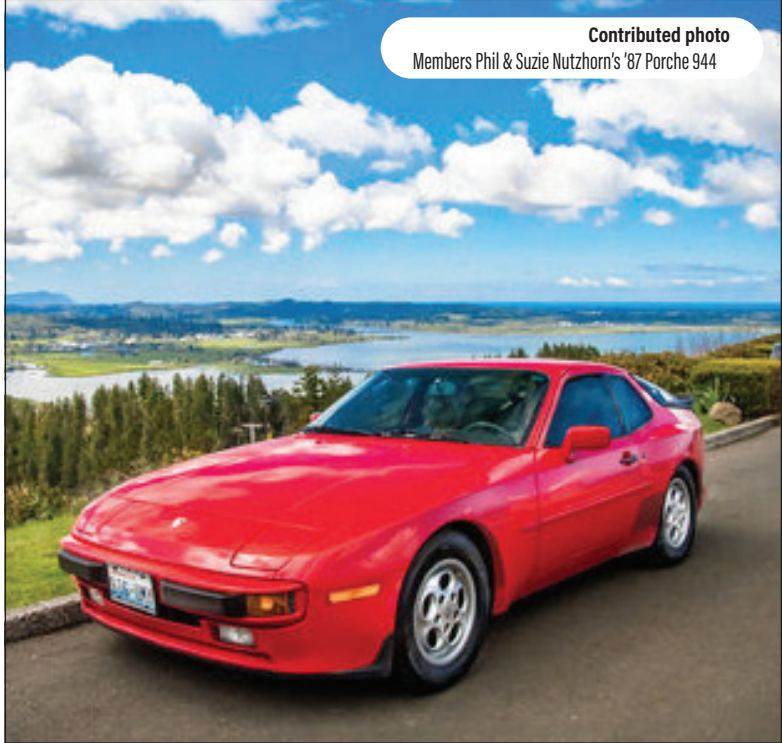
Members Phil & Suzie Nutzhorn's '87 Porche 944