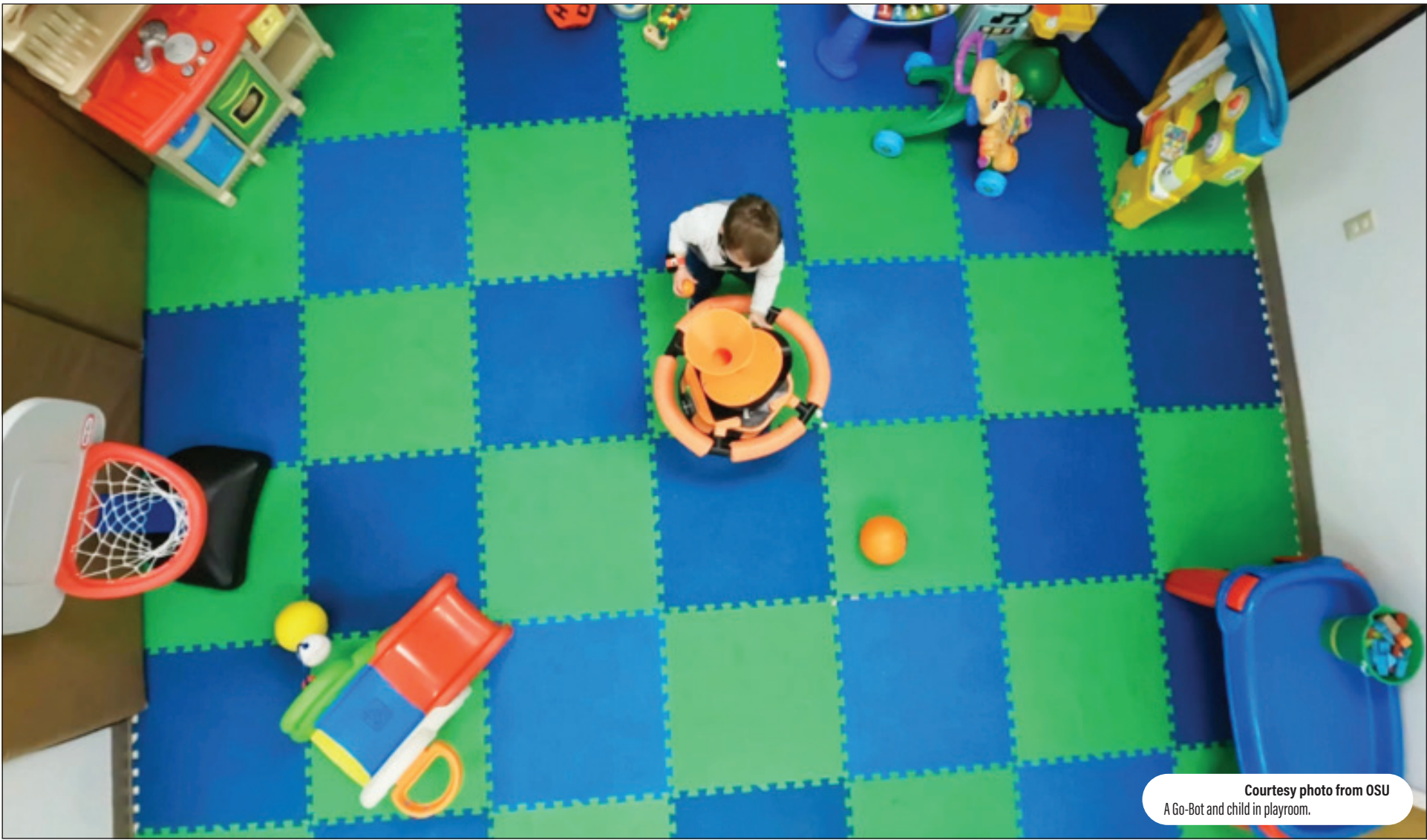
A Go-Bot and child in playroom.