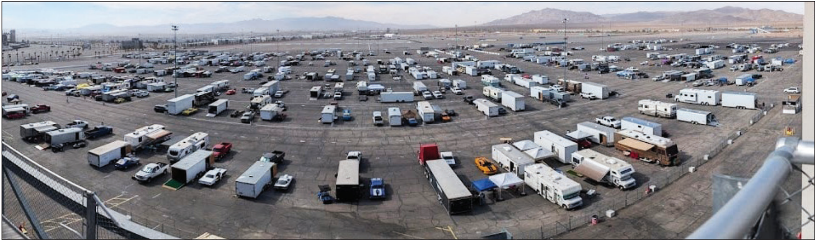
Racers representing National Hot Rod Association-sanctioned racing facilities throughout California, Nevada, Utah, Colorado, Arizona, and Hawai'i gathered at The Strip at Las Vegas Motor Speedway on October 10-13, 2024 for the Pacific Division Finals.

appearance in the quarterfinals earned the Summit Racing Equipment Racing Series rookie a Top-Eight finish in the Pacific Division in his first season competing in the series.