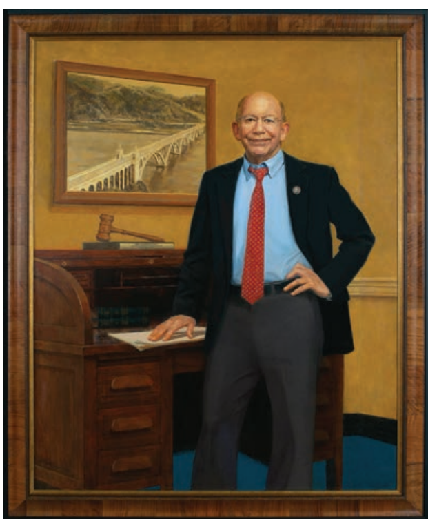
Congressman Peter DeFazio was the center of attention in Washington, D.C. on Wednesday when his official portrait honoring his time as chairman of the House Transportation and Infrastructure Committee was unveiled.