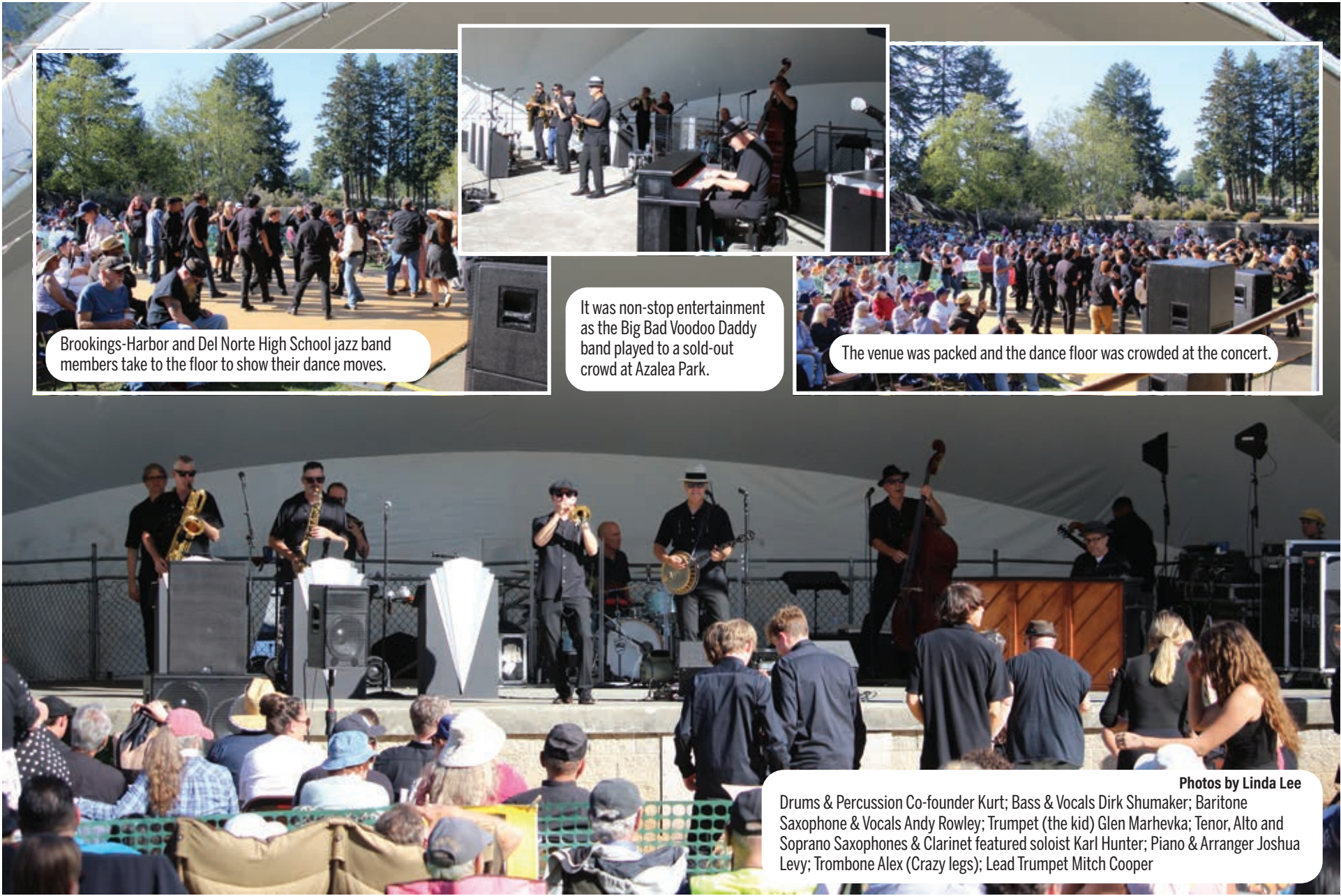
Brookings-Harbor and Del Norte High School jazz band members take to the floor to show their dance moves.