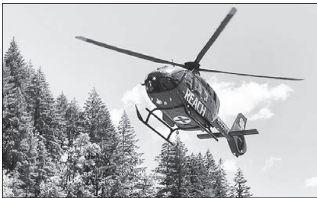
Reach Air/ Cal Ore Life Flight takes off with an injured rafter who was driven to Agness by Jerry's Rogue Jets.

Agness-Illahe Fire & Rescue notified Cal-Ore