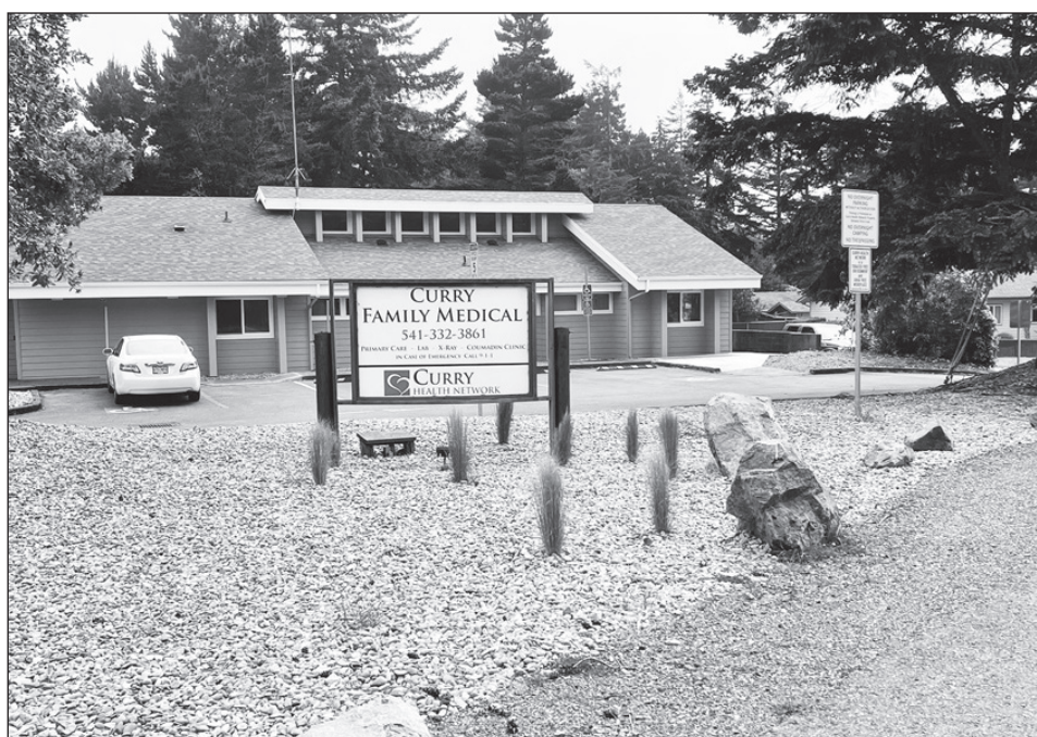
Curry Family Medical in Port Orford has a new look after renovations at the facility were completed.

in our area, and making the necessary updates that more easily and conveniently accommodate the people we serve is part of that investment. “Each patient is our most important patient, and we want to do everything we can to make sure their experience is as safe, simple and comfortable as possible.” The upgrades to the Curry Family Medical building began in June of 2021 and were completed in less than a year; the facility was originally built in 1985. “Due to a variety of factors, the building’s interior and exterior had deteriorated over the years,” said Neet. “Now, many of the changes are obvious: You notice the new landscape and sign when driving up to the clinic; there’s a new front door, windows and siding. Inside, everything’s been updated, from the colors to the materials.” Overall, the clinic’s new look was designed to have a more soothing, coast-