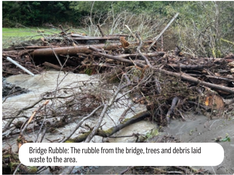
Bridge Rubble: The rubble from the bridge, trees and debris laid waste to the area.

The program's multi-faceted goals include providing adult Chinook for ocean and lower Rogue River fisheries, thereby