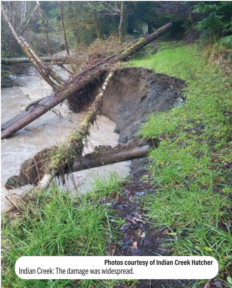
Indian Creek: The damage was widespread.