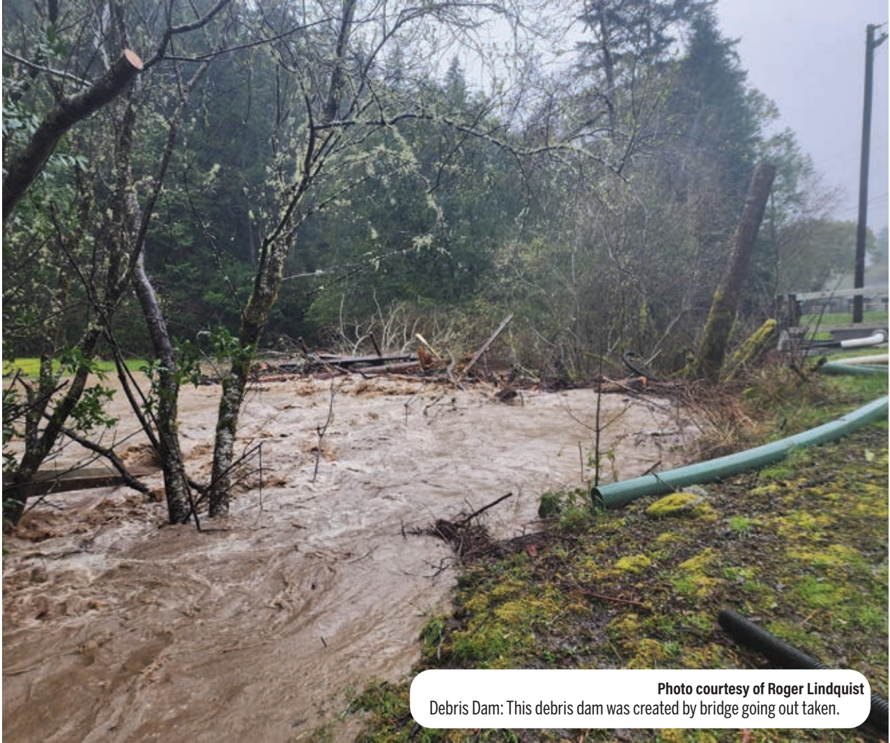
Debris Dam: This debris dam was created by bridge going out taken.