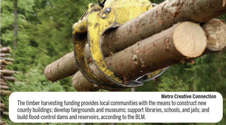
The timber harvesting funding provides local communities with the means to construct new county buildings; develop fairgrounds and museums; support libraries, schools, and jails; and build flood-control dams and reservoirs, according to the BLM.