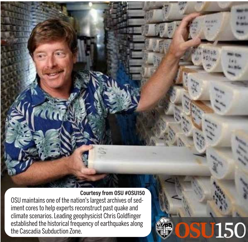
Courtesy from OSU #OSU150 OSU maintains one of the nation's largest archives of sediment cores to help experts reconstruct past quake and climate scenarios. Leading geophysicist Chris Goldfinger established the historical frequency of earthquakes along the Cascadia Subduction Zone.