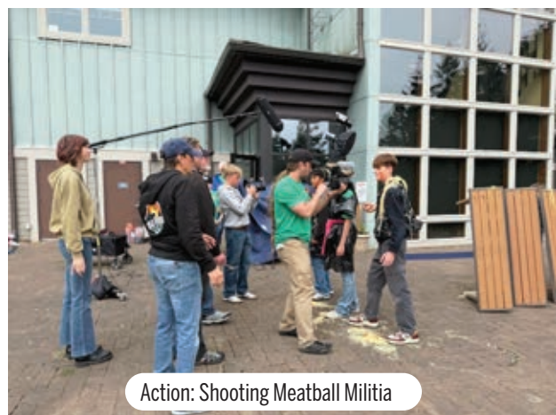
Action: Shooting Meatball Militia