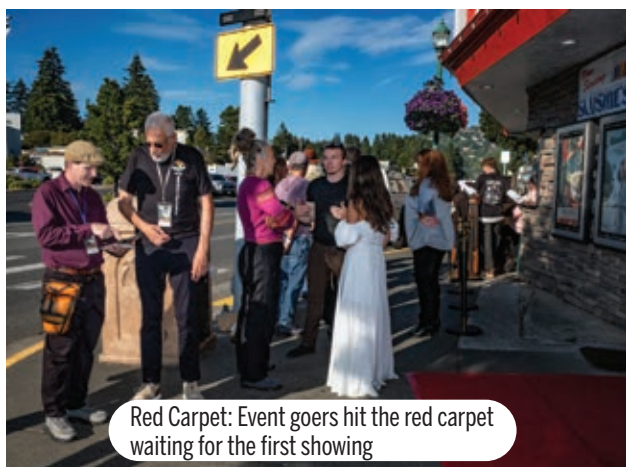
Red Carpet: Event goes hit the red carpet waiting for the first showing