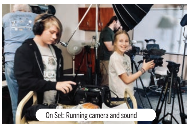
On Set: Running camera and sound

WRFF is a nonprofit organization dedicated to bringing art and culture