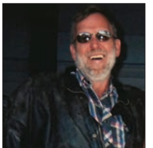
many nieces, nephews, other in-laws, and friends.