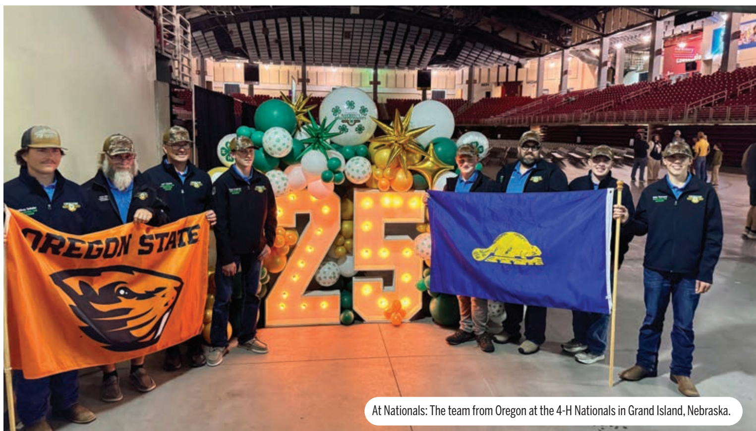
At Nationals: The team from Oregon at the 4-H Nationals in Grand Island, Nebraska.

The weather in Nebraska added an unexpected level of challenge. The week brought extreme heat, high humidity, sudden thunderstorms, and even a record 7.5 inches of rain in a single night, an amount they hadn't seen in years. That storm nearly canceled the 3D Target event, but thanks to the efforts of organizers and volunteers, all the targets were moved to a different field. The competition went forward, though it started late and