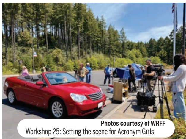
Workshop 25: Setting the scene for Acronym Girls