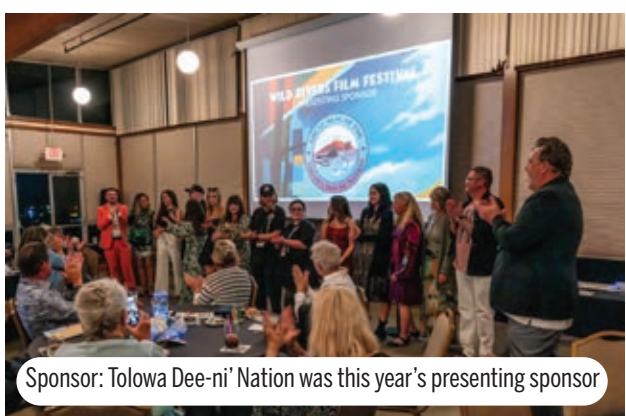
Sponsor: Tolowa Dee-ni' Nation was this year's presenting sponsor

For more information, visit wildriversfilmfestival.com.