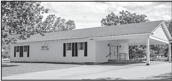
1 Promenade St., Gorham, NH