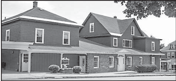
180 Hillside Ave., Berlin, NH