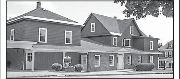
180 Hillside Ave., Berlin, NH