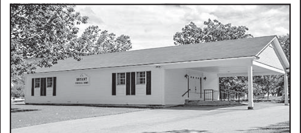
1 Promenade St., Gorham, NH