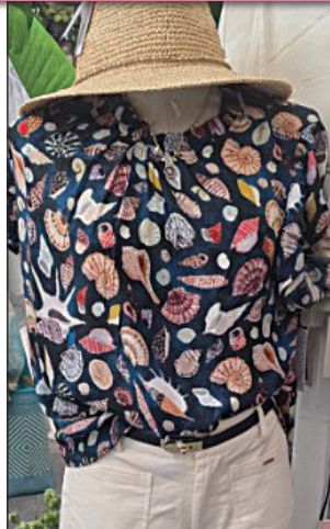
Clothing for your coastal lifestyle