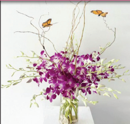
Stunning butterfly orchid arrangement