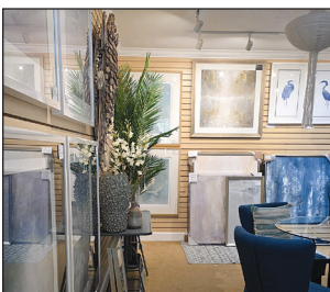
New art in our Gallery!

Beautifully Exceeding Expectations for 47 Years