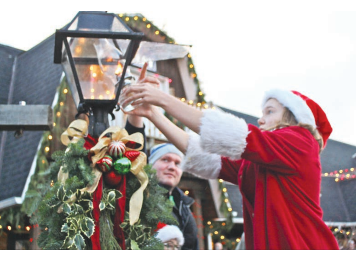
The annual Lamp Lighting ceremony is a Cannon Beach tradition.