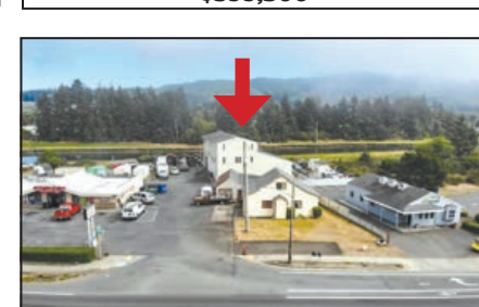
PRIME SEASIDE/HWY 101 COMMERCIAL OPPORTUNITY! $809,000