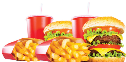
FAST FOOD FAMILY MEAL