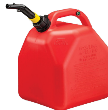
1/4 TANK OF GAS