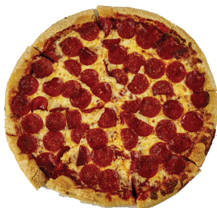
1 MEDIUM PIZZA

Each of these cost as much or more than an ENTIRE MONTH of COMPLETE ACCESS to The Caledonian-Record