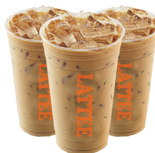
3 ICED LATTES