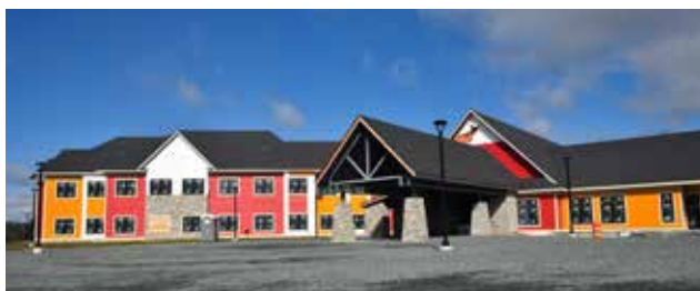
Service Credit Union, the main creditor in the senior living community bankruptcy in Littleton, says more than $44 million is owed by Granite Senior Services. SCU seeks a reclassification of the bankruptcy and is asking the court to appoint a trustee.

The property, though, is currently worth about $21 million,