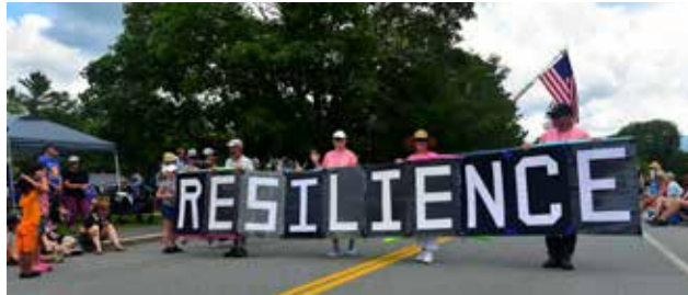
Among the participants in Franconia's 2025 Old Home Day parade was North Country Resilience.

member of the group, said North Country Resilience supports the Constitution, Bill of Rights and rule of law and is "not politically aligned right or left."