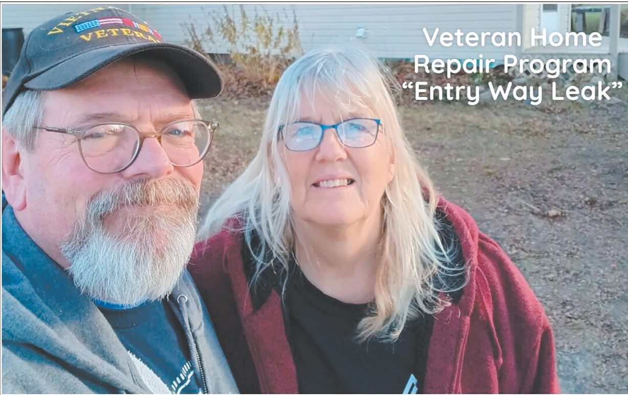
Veteran Home Repair Program "Entry Way Leak"