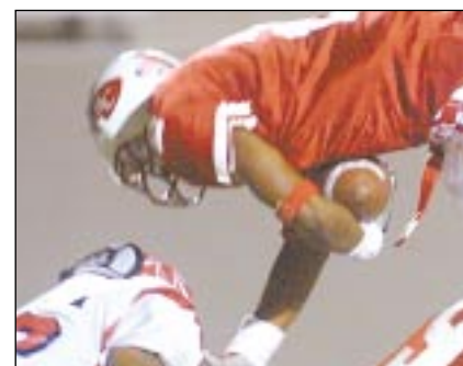
Renegades roll over West Hills, 36-3. C1