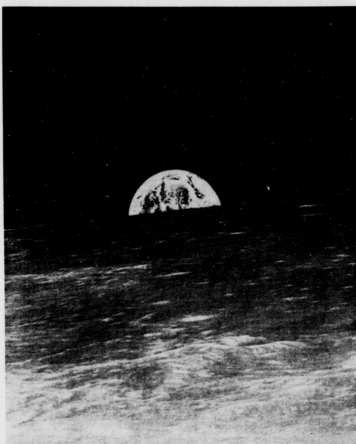
This is the Earth rising over the moon as seen from Apollo 10 command module during the moon exploration voyage.