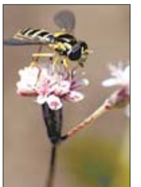
A bee visits the Mount Diablo buckwheat.

Botanists have searched in vain for the plant for decades. The find immediately drew comparisons to the recent discovery of the ivory-billed woodpecker in Arkansas, a bird long presumed extinct.