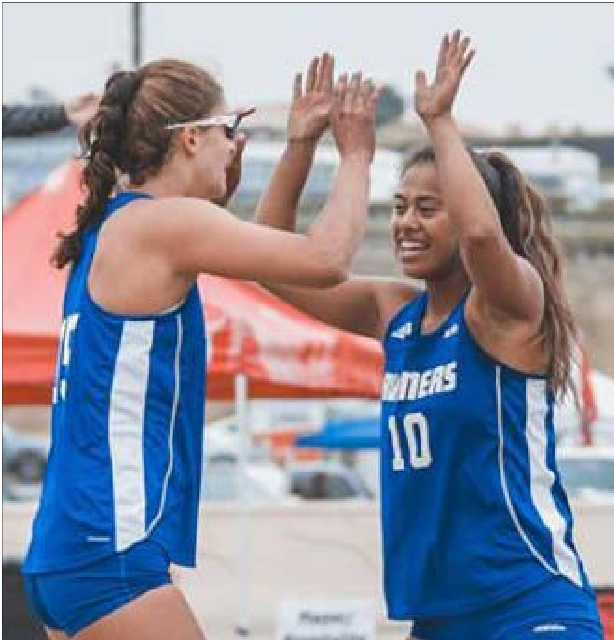
TOP: The Cal State Bakersfield beach volleyball team enjoys a team-building exercise