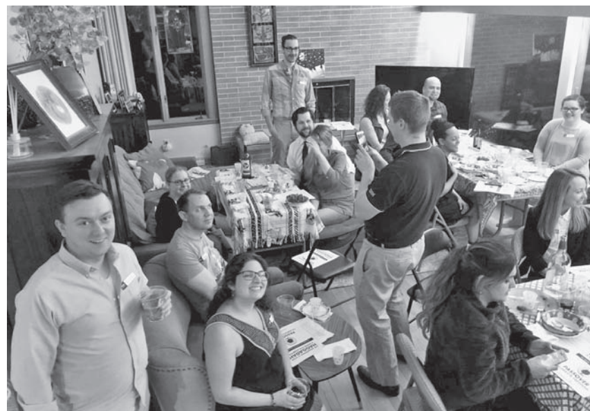
Guests at RCJ's first Togetherness Seder

Rubber City Jews is a group for those in their 20s and 30s, promoting continuity and togetherness in the Akron Jewish Community. Our organization works in partnership with and in support of the Jewish Community Board of Akron and the Sands-Rogovy Fund. For more information, visit facebook.com/rubbercityjews or email rubbercityjews@gmail.com