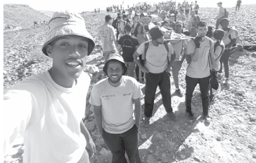
The Aharai! IDF team training in the desert in Southern Israel during Chanukah