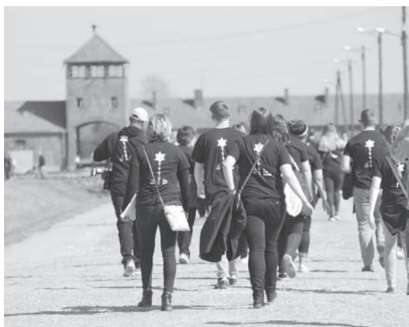
Kent State students on a trip to Poland in March. The trip was organized by the Jewish Studies Program.