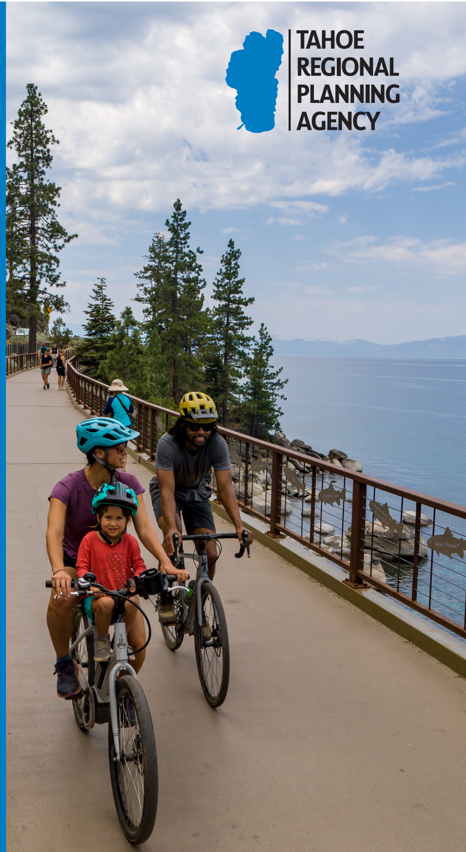
A family enjoys the Tahoe East Shore Trail.

Dear Lake Tahoe Community, Governing Board and APC Members, and Stakeholders: