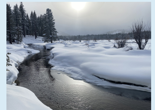
Upper Truckee River in winter 2023.