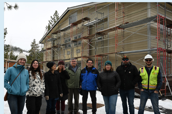
Affordable apartments at the 248-unit Sugar Pine Village project in South Lake Tahoe will be open for applications in 2024.

The amendments allow deed-restricted units within town centers and multi-family zones to be designed with more flexibility on height, land coverage, parking, and units per parcel, if they are made permanently affordable for working households and meet environmental standards.