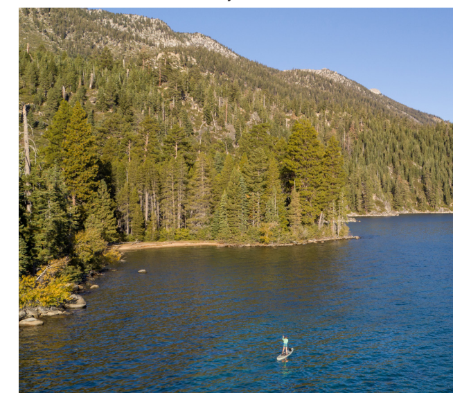
West Shore of Lake Tahoe.