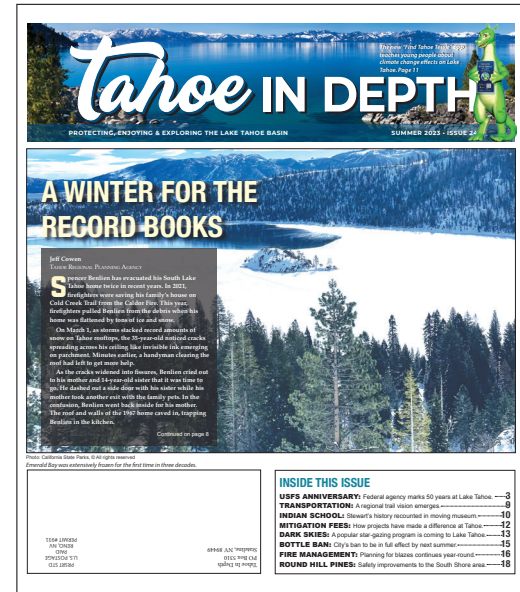
The cover of the Summer 2023 issue of Tahoe In Depth.