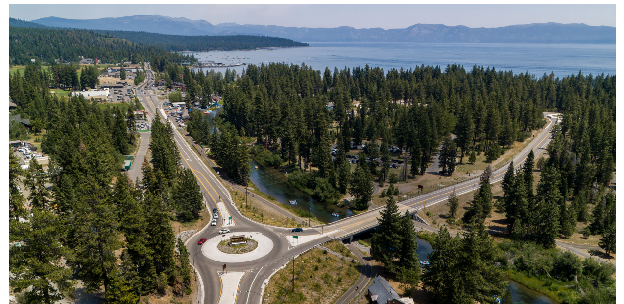
Tahoe City roundabout.

TRPA programmed more than $100 million in transportation funding for our implementation partners in 2023. These funds support new microtransit operations, Tahoe Trail segments, roadway safety improvements, and other priority transportation projects.