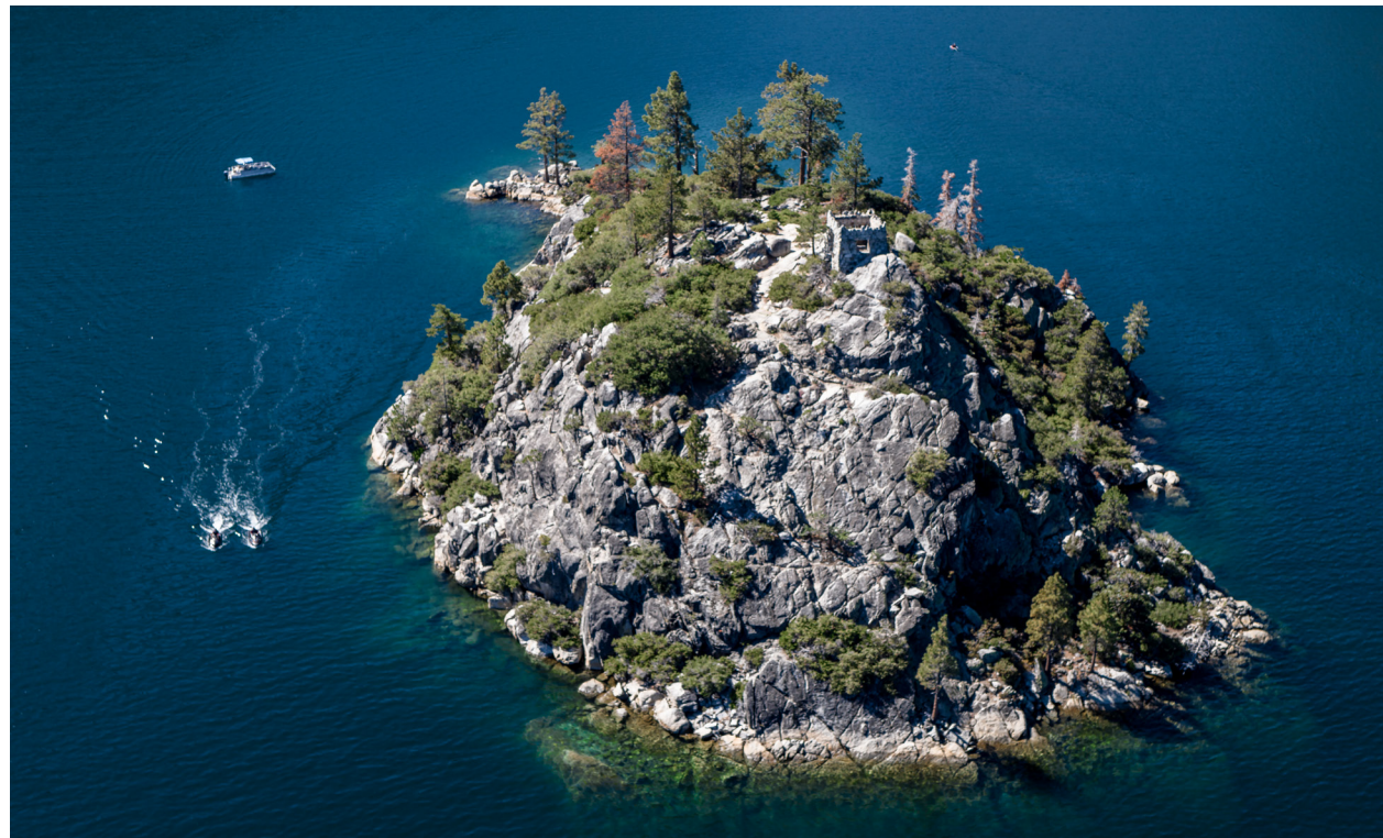
Fannette Island, Emerald Bay, CA.