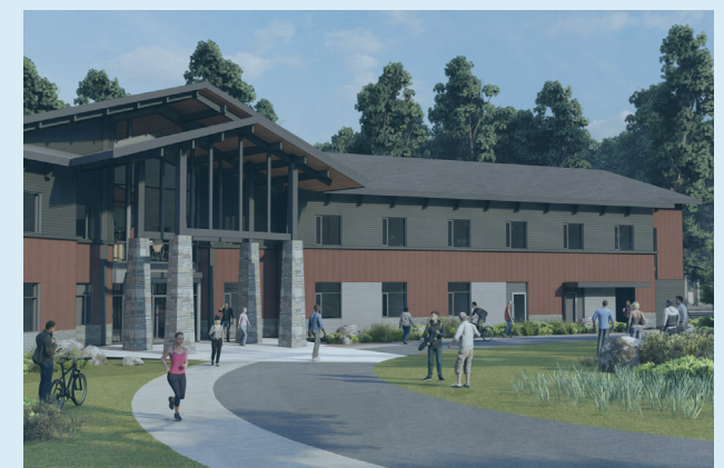
Lake Tahoe Community College student housing.

In March, the TRPA board unanimously approved the Lake Tahoe Community College (LTCC) Student Housing Project, which will provide up to 100 students with affordable on-campus housing. The project broke ground this year and is anticipated to open in 2025. Environmental benefits include reduced vehicle trips to and from campus and heated sidewalks that reduce the need for snow removal equipment and de-icing.