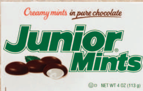
Theater Box Candy 9285008, 9150889, 9150848, 9158007