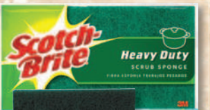
Scotch-Brite® Heavy Duty Scrub Sponge or Scouring Pad 3/Pk. 12904, 17443