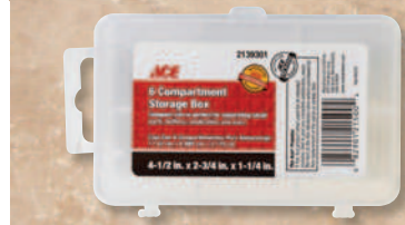
Ace 6 Compartment Storage Box 2139301