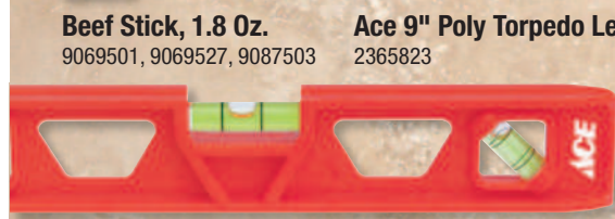
Ace 9" Poly Torpedo Level 2365823