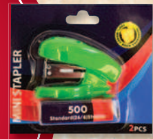
Mini Stapler with Staples 6286454