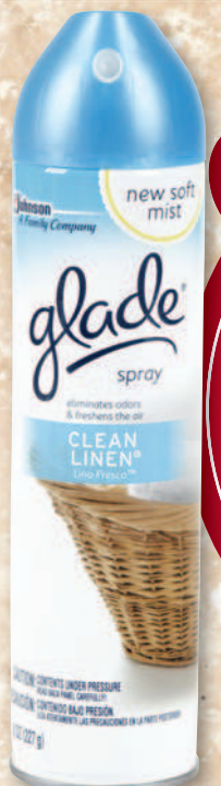
Glade® Room Air Freshener Spray, 8 Oz. 18405, 1493840