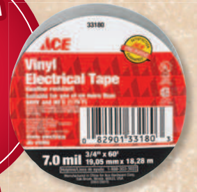
Ace 3/4" x 60' Electrical Tape 33180