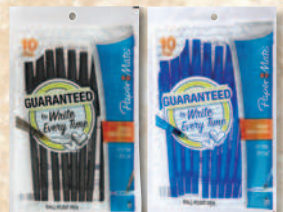
Paper Mate® Liquid Paper® Correction Pen or WriteBros® Ballpoint Pen 10/Pk. 9244567, 9244682, 9245135