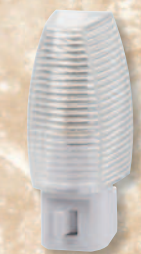
Ace Night Light 3031895