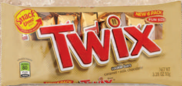
Fun Size Candy 6/Pk. 9224296, 9284662, 9224262, 9284704, 9224270