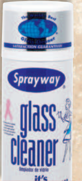
Glass Plus® Glass & Surface Cleaner, 32 Oz. 13035