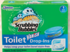
Vanish® Drop-Ins™ Toilet Bowl Cleaner 17408