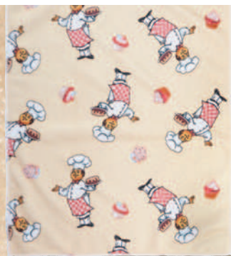
15" x 25" Kitchen Towel 6246243