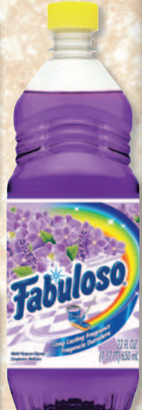
Fabuloso® Cleaner, 22 Oz. 1500883, 1500891