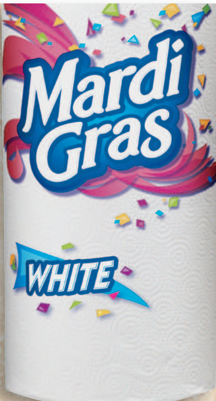
Mardi Gras® Paper Towels 6162044