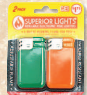
Lighter 2/Pk. 6284848