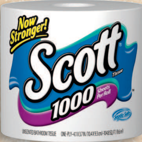
Scott Bathroom Tissue 6202634