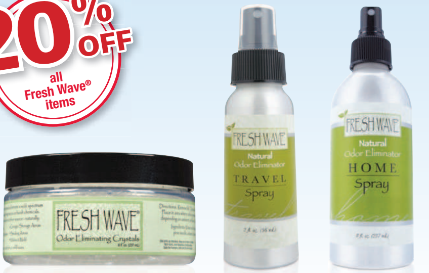
Store stock only. Sorry, no rain checks. Offer valid at participating Ace stores through February 9, 2015.

20% OFF Culligan® whole house and refrigerator water filters