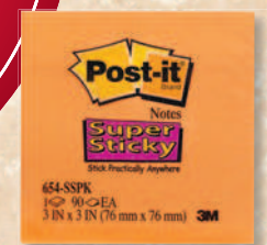
Super Sticky Post-It® Notes 9239922