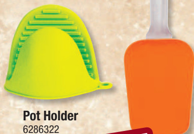
Pot Holder 6286322