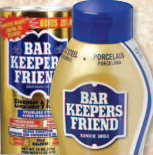
Bar Keepers Friend® 15 Oz. Cleanser & Polish or 26 Oz. Liquid Cleanser 10046, 1270164

20% OFF Culligan® whole house and refrigerator water filters