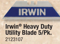
Irwin® Heavy Duty Utility Blade 5/Pk. 2123107