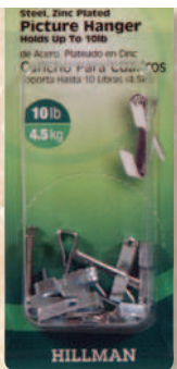
Picture Hangers 10, 20, 30, 50 or 100 lb. capacity. 50963, 50964, 50965, 50966, 50967