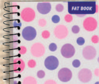
Spiral Notebook 6286702