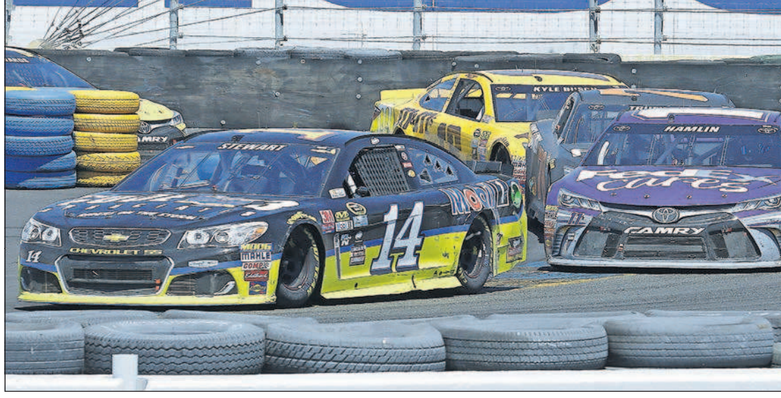
Tony Stewart, driving the No. 14 Chevrolet, leads Denny Hamlin, who is behind the wheel of the No. 11 Toyota, through Turn 11 in the closing laps of the road-course race at Sonoma on Sunday.