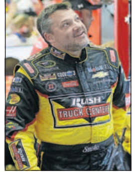
Things may be looking up for Tony Stewart.

Well, kinda-sorta. It depends on whether you buy the conventional wisdom that Tony drives harder and better when he's in a bad mood. As NASCAR makes its way to Daytona Beach for Saturday night's Coke Zero 400, it's a great time to consider the merits of that theory.