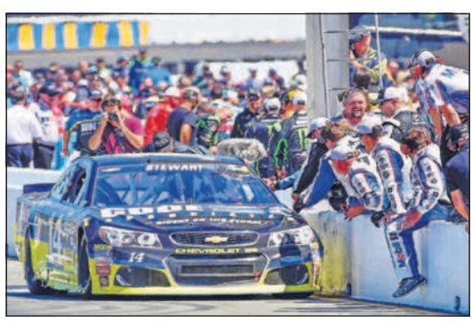
Tony Stewart, 45, scored one for the small group of 40-something NASCAR drivers when he captured the race at Sonoma, then was congratulated by his race team on pit road.

If you are looking for some sort of continuity to recent restrictor-plate race wins at Daytona and Talladega, there