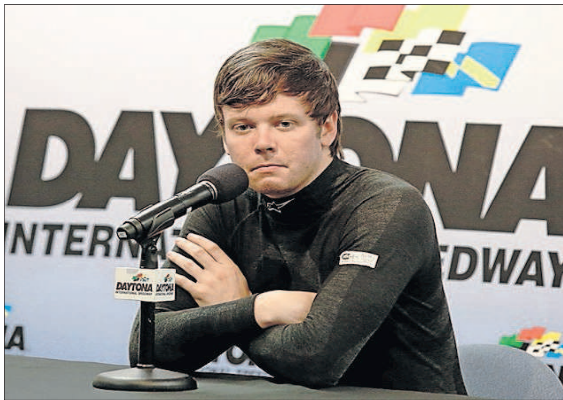
Erik Jones likely had a similar look on his face after his four-lap run at Richmond on Sunday.