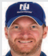
DALE EARNHARDT JR.