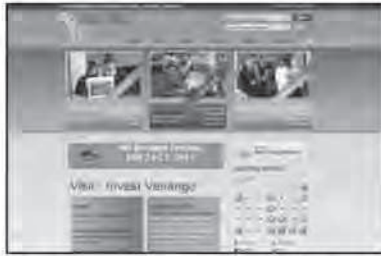
Homepage of the Chamber website

The Chamber's website provides current and relevant information in a dynamic format. Along with providing valuable information about the Chamber and the region, it includes a comprehensive Member Directory, online registration for Chamber events, and a community calendar that allows anyone to submit an event.