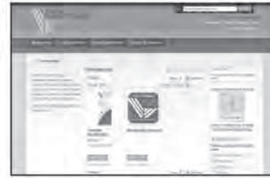
Online registration and membership

In addition to the website, the Venango Area Chamber office provides information for not only members, but the community and visitors. The chamber's visible and convenient location makes it a frequent stop for tourists and those who are new to the area. A brochure rack is located within the Chamber with maps and information on different restaurants, hotels, businesses, and activities available.