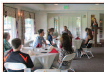
Interns at the 2014 Intern Appreciation Luncheon held at Wanango Golf Club