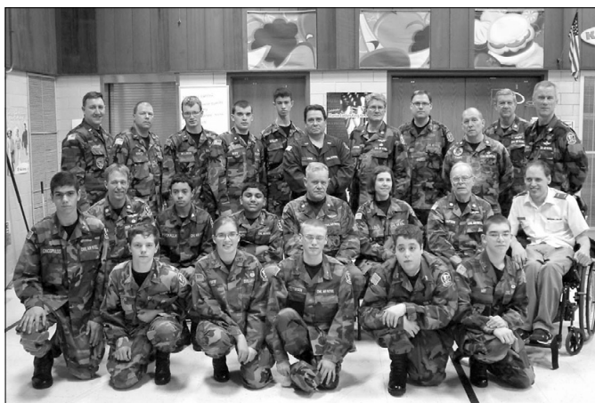
Members of Viking Squadron participated in a food-packing event in support of the Hunger Initiative Organization.