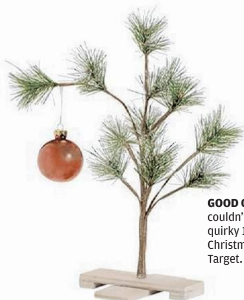
GOOD OL' CHARLIE • We couldn't resist this simple, quirky 18-inch Charlie Brown Christmas Tree ($14.99) at Target.