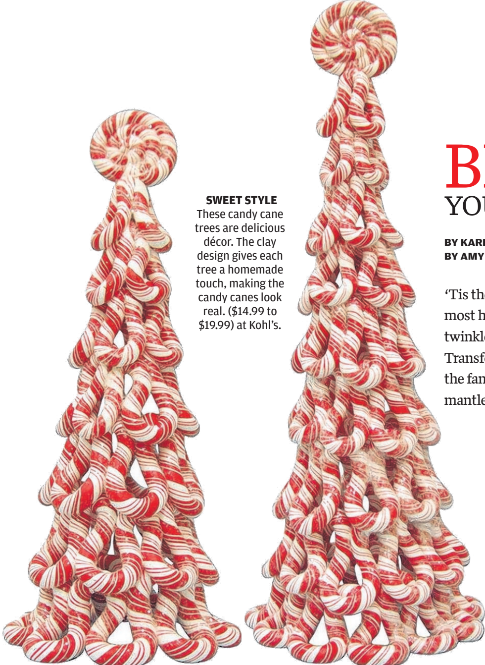
SWEET STYLE These candy cane trees are delicious décor. The clay design gives each tree a homemade touch, making the candy canes look real. ($14.99 to $19.99) at Kohl's.

'Tis the season for holiday décor. It's a fun and exciting time, and in most households, things are looking a bit more festive. ✨ Add your own twinkle, twinkle to a mantel, or a shimmer of glitter to a buffet table. Transform a dining table into icy glass pieces or bring a little magic to the family room. ✨ Whether it's sprucing up your tree, decorating your mantle or styling a table, we found a lot of bright ideas.