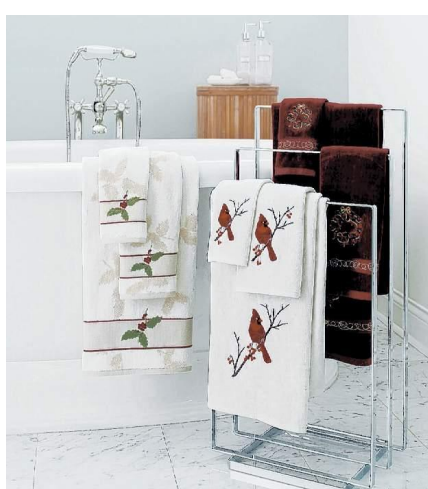
DRY TIME • Add seasonal cheer to your bathroom with holiday-themed towels: cream Cardinal towels ($12.99 to $24.99), wine wreath towels ($12.99 to $24.99) and cream holly towels ($12.99 to $24.99) at Kohl's.