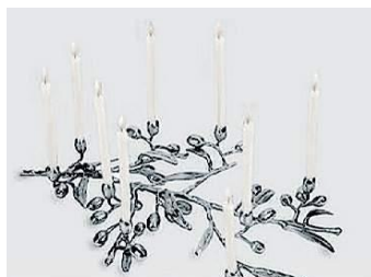
METAL WORKS • The Michael Aram Olive Branch Menorah, from the Olive Branch collection, will warm any room or holiday table. It's 14 inches long and nickel-plated ($239) at saksfifthavenue.com . Check stores for availability.