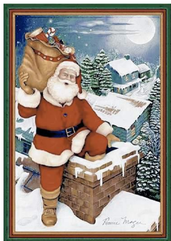
HERE COMES SANTA • This accent rug (30-inch-by-46-inch) features Santa up on the housetop ($34.98) at Lowes.com (check stores for availability).