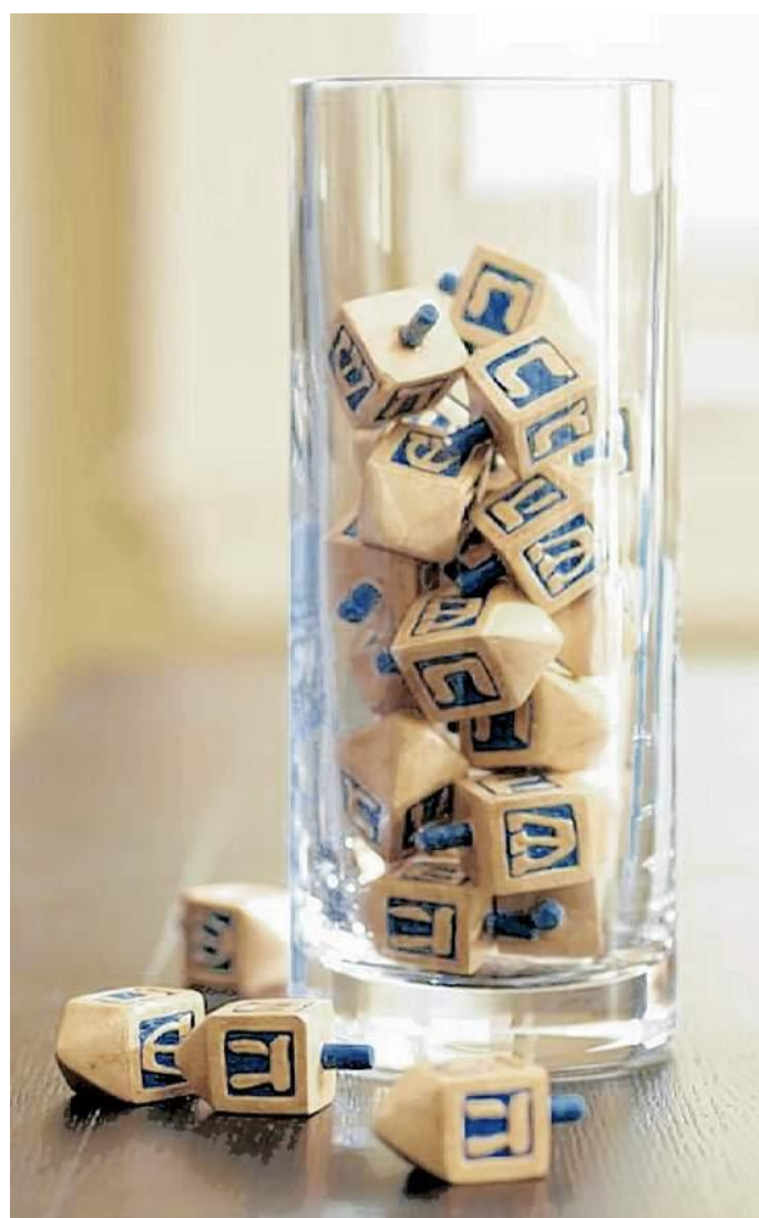
FILLER • Fill a glass bowl or large vase with this set of eight handcrafted dreidels ($19.50) at Pottery Barn and potterybarn.com .