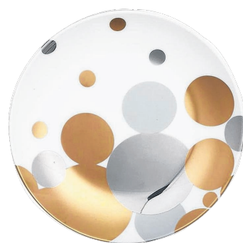
DRESS UP • Random gold and silver dots are tossed on this white porcelain plate to celebrate the season ($6.95) at Crate and Barrel, 1 The Boulevard.