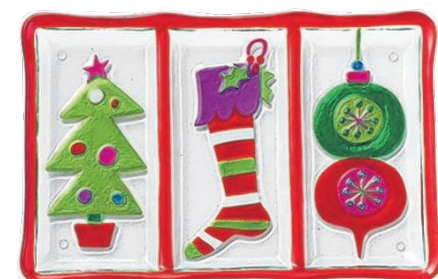
HOLIDAY ART • Fusion art glass plates for the holidays can be a beautiful piece of art or the perfect way to pass the appetizers ($38.99) at Terra, 11769 Manchester Road.