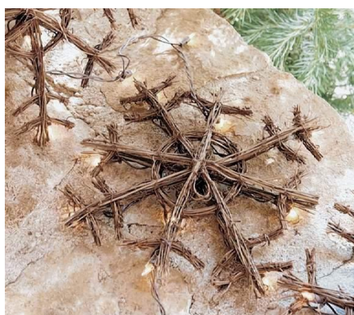
BRANCHING OUT • This 72-inch strand of garland is made of woven twigs and wrapped with tiny white lights on 9-inch snowflakes ($49) at Potterybarn.com .