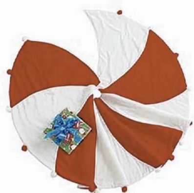
RED HOT • Talk about eye candy. The peppermint tree skirt might be the tastiest treat under your tree ($45) at Pier 1 Imports.