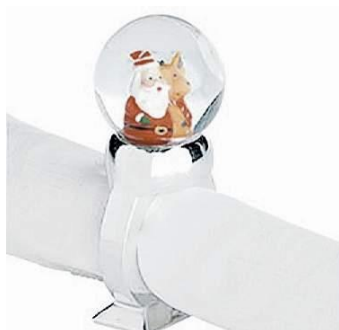
IT'S SNOWING • What's shakin' this holiday? These super-cute, hand-painted snowglobe napkin rings ($4.95 each) at Pier 1 Imports.