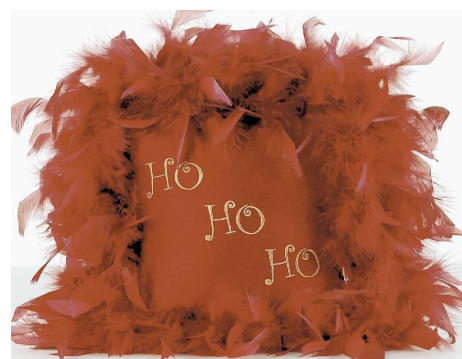
OH SO SOFT • This Ho Ho Ho satin feather pillow is so charming and will add a festive style to any room ($12) at Dillard's.