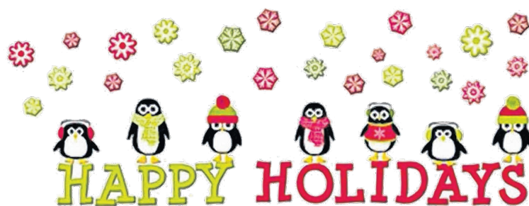
STICKY SITUATION • This set of peel-and-stick holiday penguin stickers is easy to remove and reposition for instant holiday style ($24.99) at JC Penney and jcpenney.com