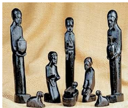
CUSTOM CARVINGS • This Nativity set, handcarved in the Congo, includes nine pieces: the Three Wise Men, Joseph, Mary, Baby Jesus, a manger and two sheep ($64.95) at the National Shrine of Our Lady of the Snows catalog, snows.org/gs .