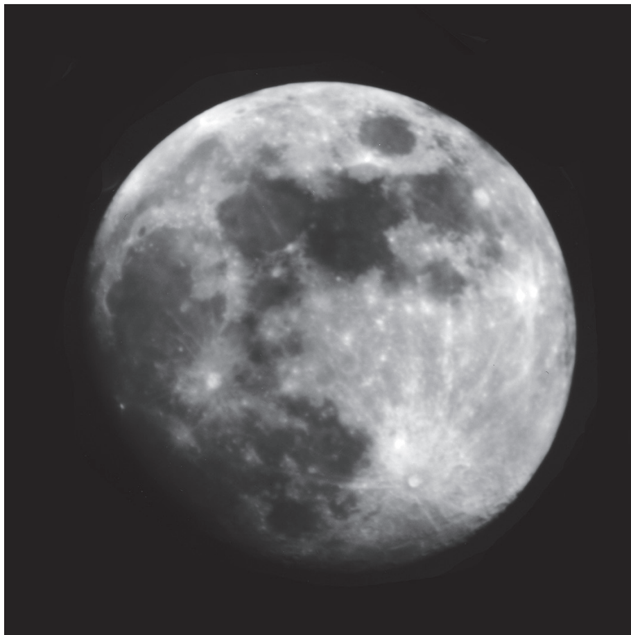
New Mexico History Museum/Palace of the Governors, 113 Lincoln Ave., shows work by photographer Donald Woodman in the exhibit Transformed by New Mexico .

Pianist/vocalist Bob Finnie, '50s-'70s pop, 6:30 p.m., call for cover.