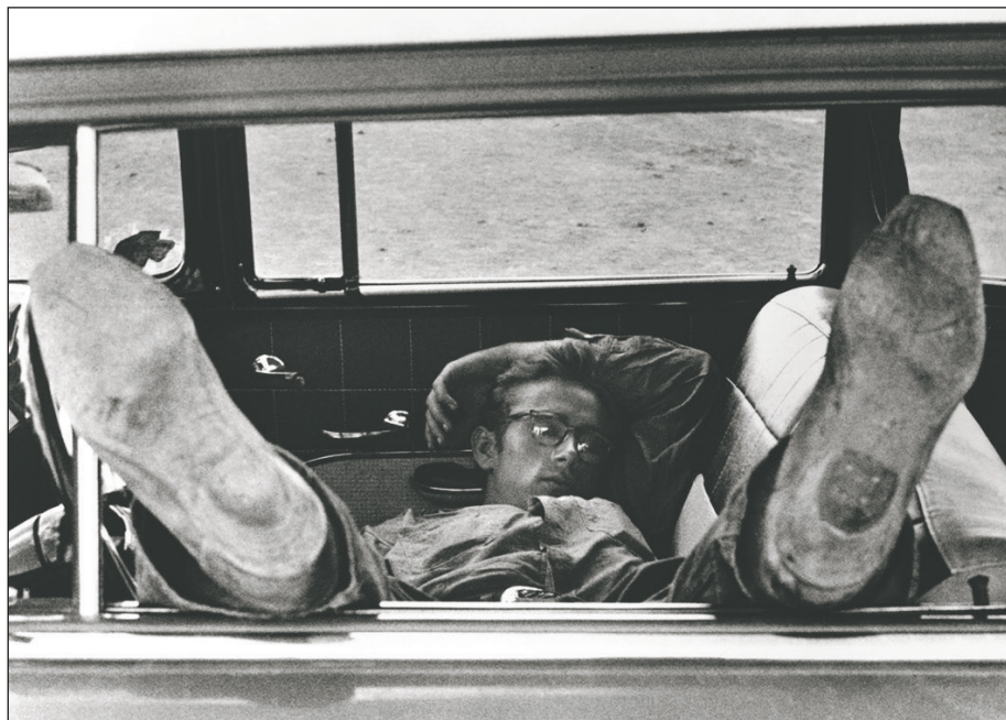
James Dean taking a break on the set of Giant, 1956, Monroe Gallery of Photography, 112 Don Gaspar Ave.