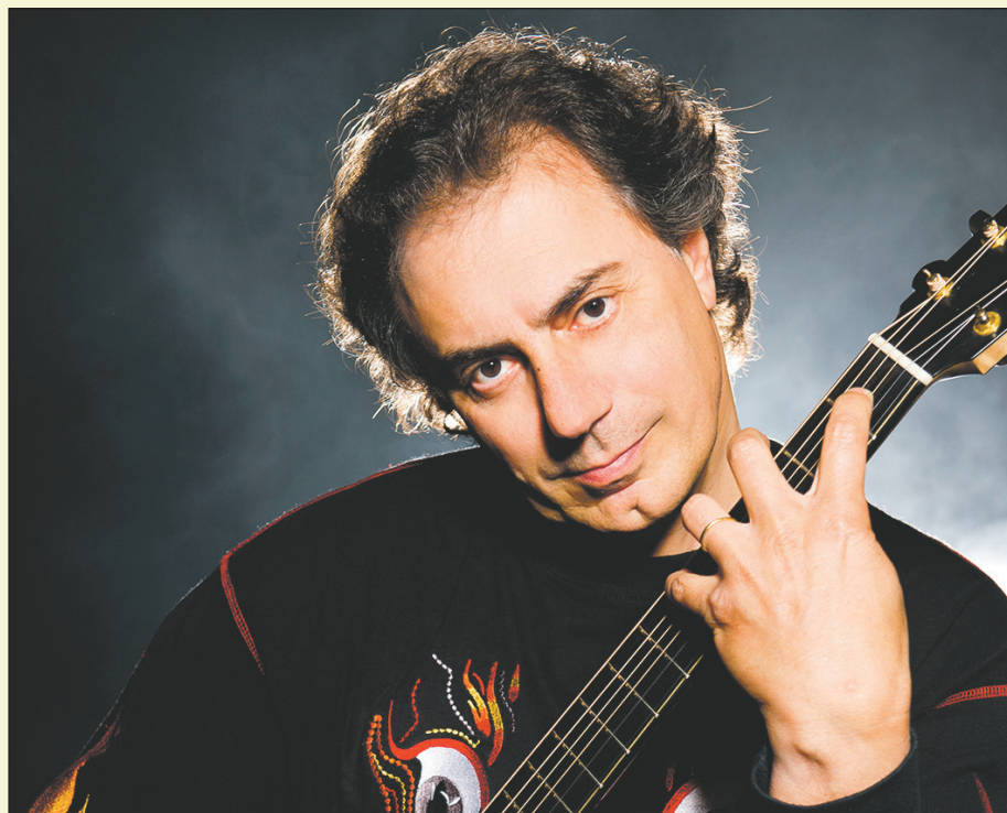
Pierre Bensusan performs at Garrett's Desert Inn Music Room March 26.

The PBS series visits Albuquerque for an all-day appraisal of all collectibles big and small, Saturday, July 19, no charge, but tickets are required and must be obtained in advance by Monday, April 7, pbs.org/antiques, 888-762-3749.