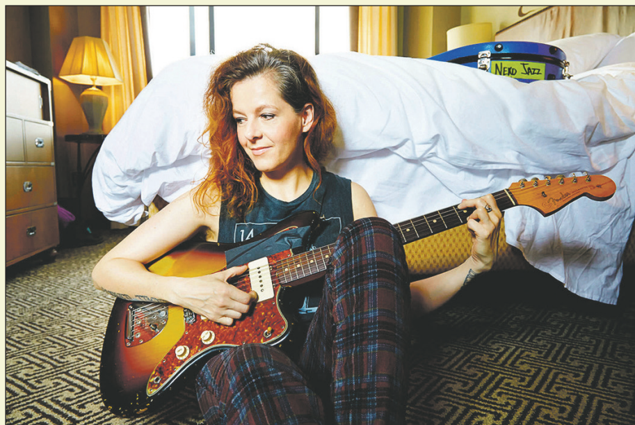
Neko Case performs April 14, at the Lensic.

Highlighting toys from the permanent collection with the exhibit Toys and Games: A New Mexico Childhood , games held in the Palace of the Governors Courtyard, 2-4 p.m. Sunday, May 25, New Mexico History Museum, 113 Lincoln Ave., by museum admission, 505-476-5200.