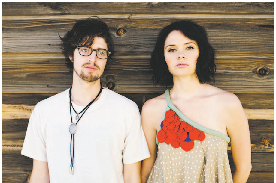
Roots-rock duo HoneyHoney perform Oct. 1 at Sklylight.

The Lensic Author/journalist Douglas Preston's lecture, held in support of the School for Advanced Research, 6:30 p.m. Tuesday, Oct. 20, reception 7:45 p.m. at La Fonda's La Terraza Room, lecture $10-$25, reception $60, ticketssantafe.org, 505-988-1234.