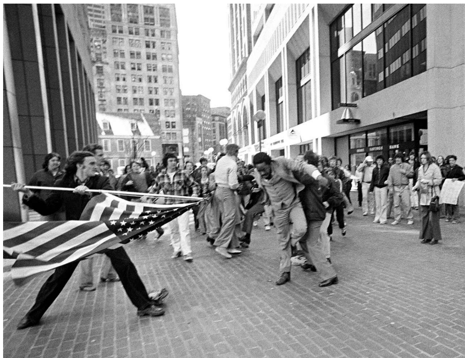
Monroe Gallery of Photography (112 Don Gaspar Ave.) hosts a panel discussion on photojournalism and civil rights on Friday, in conjunction with the exhibit The Long Road: From Selma to Ferguson . Above, The Soiling of Old Glory, Anti-Busing Protest, Boston, 1976 © Stanley Forman.