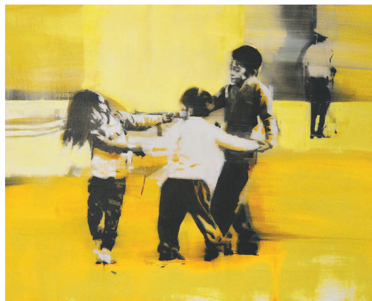
Mark Horst: Children Playing Ring Around the Rosie 2 2015, oil on canvas

Canyon Road Contemporary Art, 403 Canyon Road, 505-983-0433