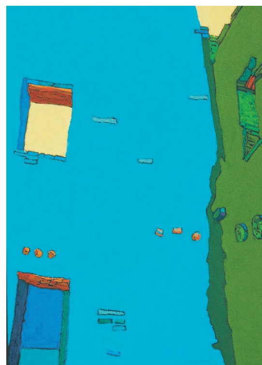
Mary Silverwood: Chaco Series No. 52 2006, pastel

Ventana Fine Art, 400 Canyon Road, 1-800-746-8815 The landscapes of Barry McCuan and the architectural pastels and landscapes of Mary Silverwood (1932-2011) make up Sunlit Splendor , a vibrant exhibition of two distinctive but related visions. "Composition and color are the most important aspects of my paintings," wrote Silverwood. "I draw upon the shades and tones of nature, but I like to exaggerate them, dramatizing the emotional exuberance that the landscape conveys to me." McCuan's plein-air paintings, too, are inspired by the innate beauty of nature and he works close to sunset and sunrise to capture distinctive qualities of light and color. The show opens with a 5 p.m. reception on Friday, Sept. 18.