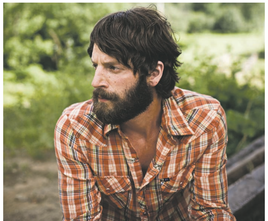
Singer/songwriter Ray Lamontagne performs Aug. 5 at the Downs of Santa Fe.

On The Plaza Thursday, Aug. 21; sneak preview Friday, Aug. 22; live auction dinner and gala Saturday, Aug. 23; market Saturday and Sunday, Aug. 22-23; swaia.org , 505-983-5220.