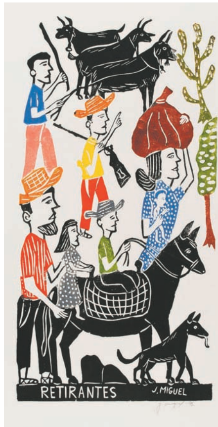
J. Miguel da Silva, Retirantes , 1995, in the Museum of International Folk Art exhibit Between Two Worlds: Folk Artists Reflect on the Immigration Experience .

108 Cathedral Place, 505-983-1777 Free public event held 5-7 p.m. Wednesday, July 16, in conjunction with the temporary site-specific