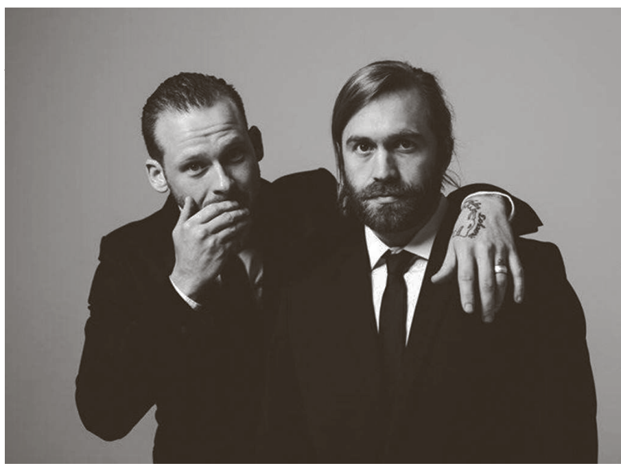
Folk duo Penny & Sparrow perform at Skylight (139 W. San Francisco St.) on Tuesday.