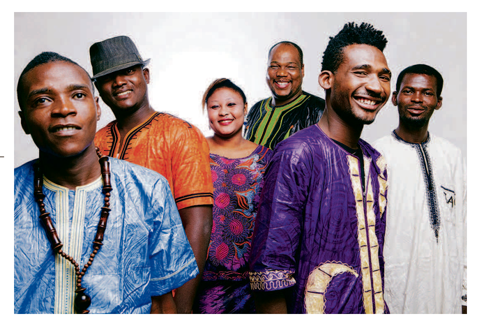
Nigerian band Tal National performs on Saturday, March 12, at Skylight.

The school and Currents New Media present a student/faculty/staff-created video projections, interactive multimedia and art installations, and animation, 8:45-10:45 p.m. Friday, April 29, no charge.