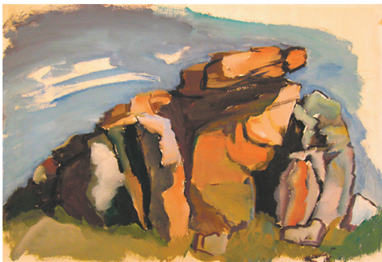
Rimi Yang: Queen's New March 2014, oil on canvas

The gallery presents Landscapes and Cloudscapes: As Seen Through Gestural Abstract Painting , an exhibition of modernist and contemporary works by Ward Jackson, Wolf Kahn, Matsumi Kanemitsu, Beatrice Mandelman, Forrest Moses, and Jon Schueler. The artists use abstraction to explore imagery of land and sky. The show is on view through Aug. 24. There is no reception.