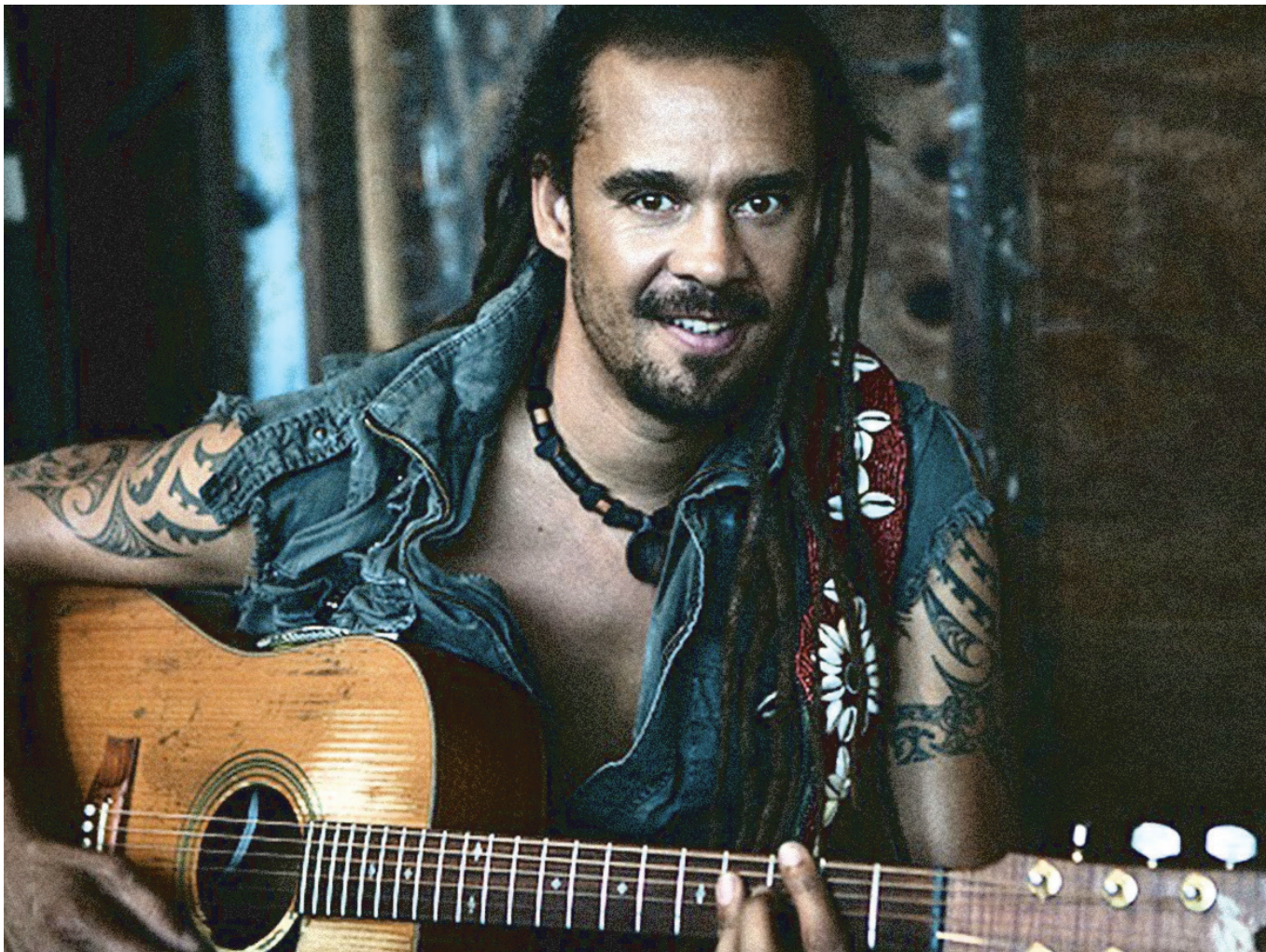
Michael Franti and Spearhead perform on Saturday at the Downs of Santa Fe, 27475 W. Frontage Rd.