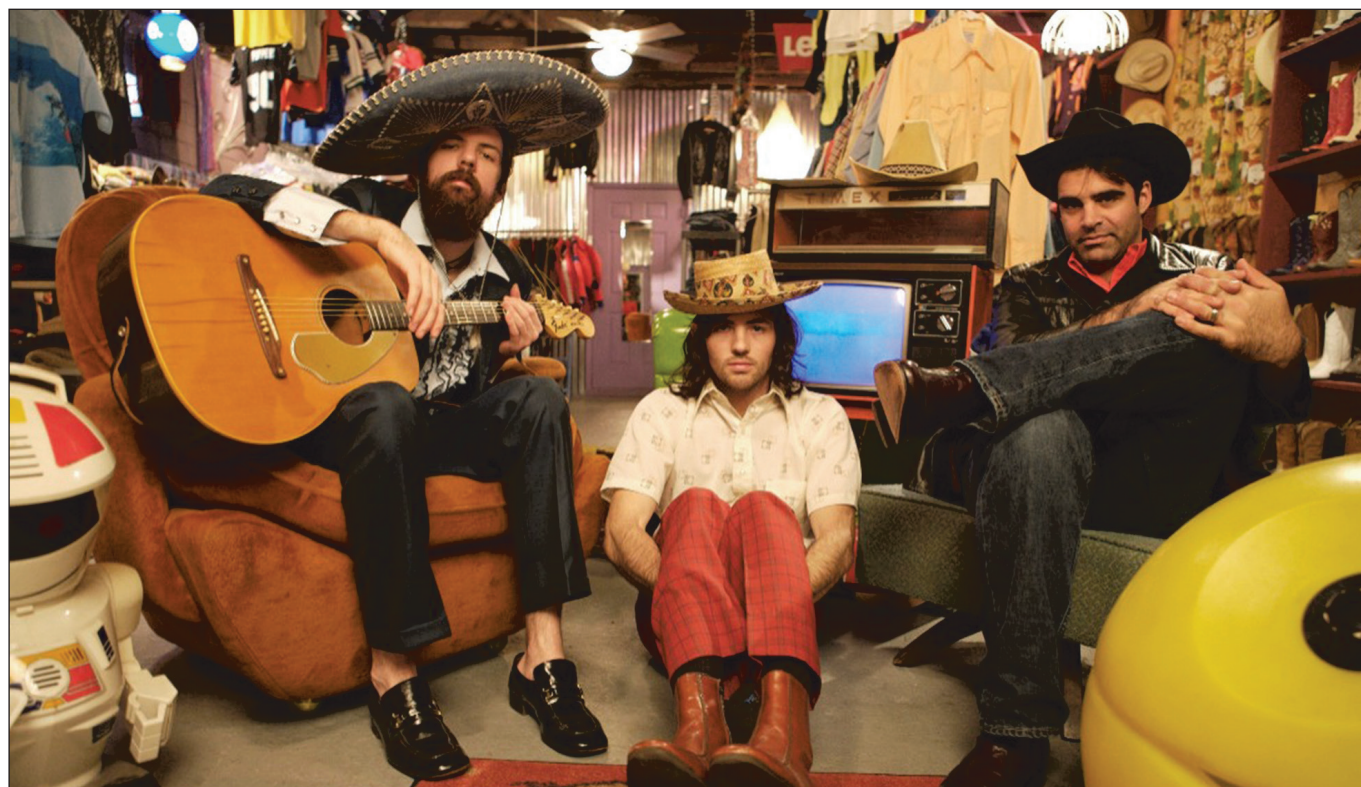
Folk-pop band Avett Brothers performs at the Santa Fe Opera Aug. 27.

On The Plaza Thursday, Aug. 21; sneak preview Friday, Aug. 22; live auction dinner and gala Saturday, Aug. 23; market Saturday and Sunday, Aug. 22-23; swaia.org, 505-983-5220.