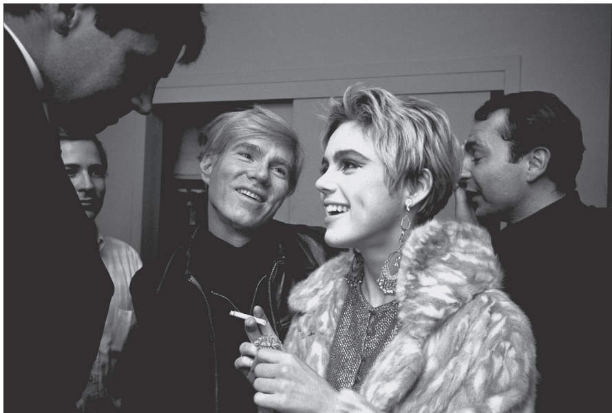
Andy Loves Edie, Andy Warhol and Edie Sedgwick, New York 1965, gelatin silver print

Monroe Gallery of Photography, 112 Don Gaspar Ave., 505-992-0800