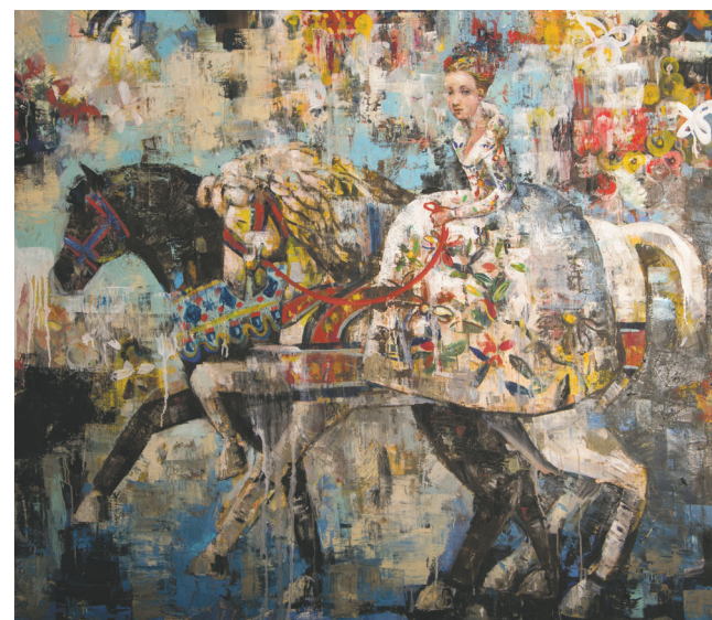
Ben Steele: Tamed 2014, oil on canvas

The Year of the Horse , an exhibition of paintings by Rimi Yang and glass sculpture by Shelley Muzylowski Allen, is showing at Blue Rain Gallery. Yang's expressionistic, horse-themed canvases combine abstract and figurative imagery in a patchwork of colors. Muzylowski Allen's glass works capture the same creature in a variety of poses that accentuate the beauty of its form. The opening reception is at 5 p.m. on Friday, July 4.