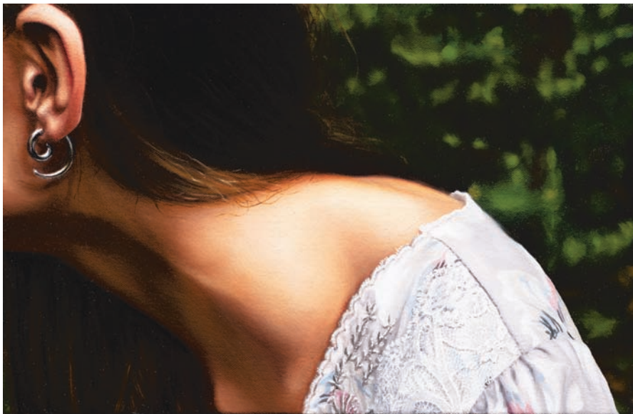
Arin Dineen: Caesura 2 2013, oil on canvas

Ellsworth Gallery, 215 E. Palace Ave., 505-989-7900