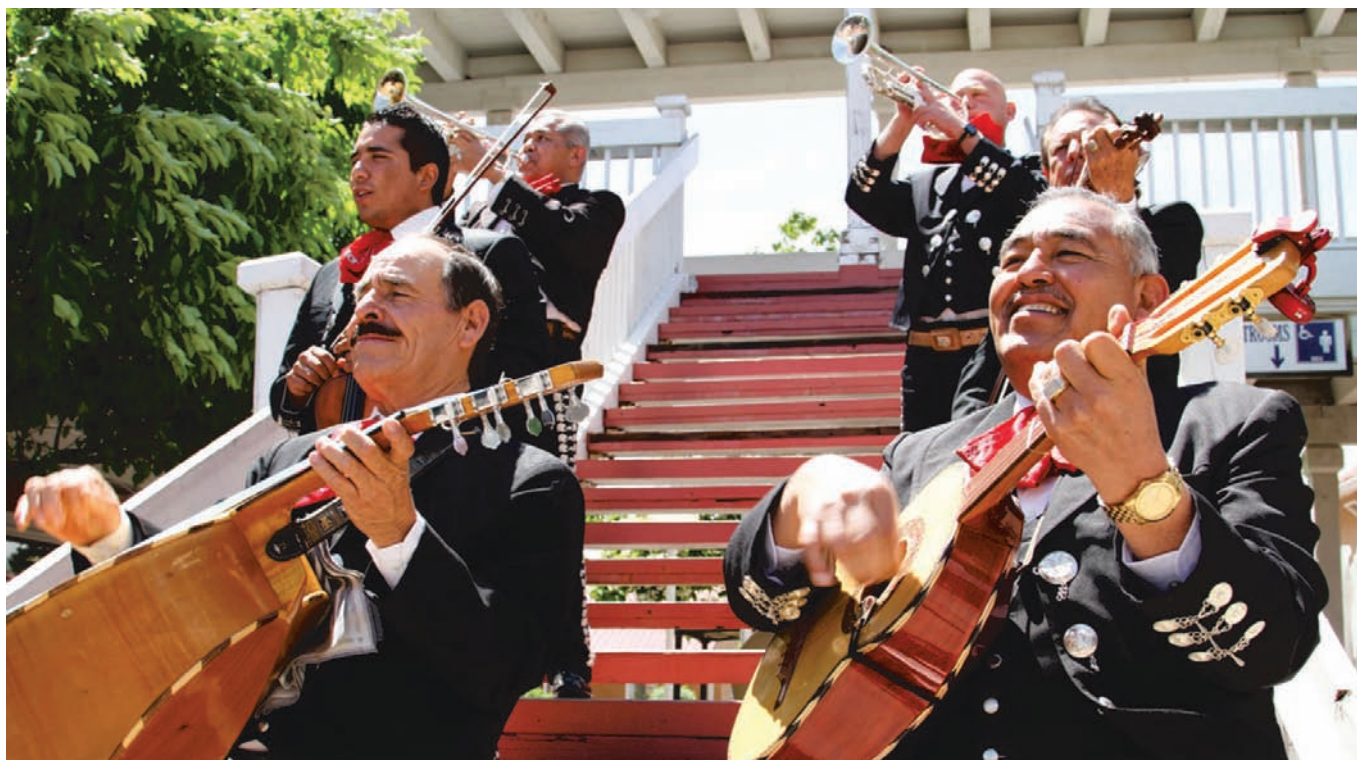
Mariachi Nuevo Sonido performs during the sixth annual mariachi and dance concert at Buffalo Thunder Resort & Casino on Saturday, Aug. 9.

On The Plaza Thursday, Aug. 21; sneak preview Friday, Aug. 22; live auction dinner and gala Saturday, Aug. 23; market Saturday and Sunday, Aug. 22-23; swaia.org, 505-983-5220.