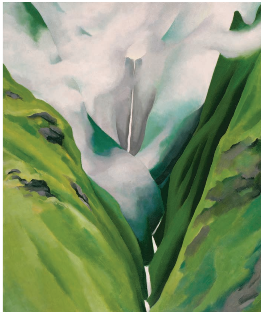
Georgia O'Keeffe: Waterfall #3, Lau Valley , Georgia O'Keeffe Museum, 217 Johnson St.

Everybody's Neighbor: Vivian Vance , family memorabilia and the museum's photo archives of the former Albuquerque resident, through January 2015 • Arte en la Charrería: The Artisan-ship of Mexican Equestrian Culture , more than 150 examples of craftsmanship and design distinctive to the charro. Closed Mondays; cabq.gov/culturalservices/albuquerque-museum/general-museum-information; closed Mondays.