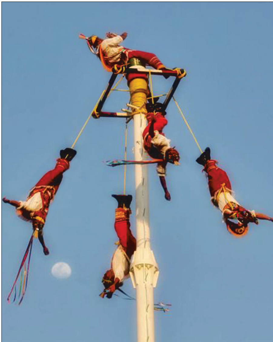
Mexico's aerial troupe performs as part of the ¡Viva Mexico! celebration Saturday and Sunday, at El Rancho de las Golondrinas, 334 Los Pinos Rd.