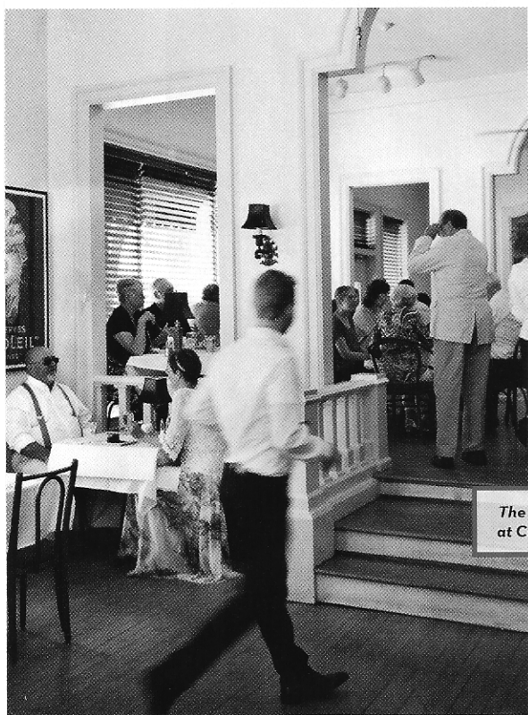
The dining room at Chez Foushee