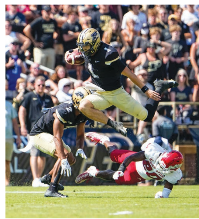
Junior quarterback Hudson Card hurdles over Fresno State defensive back Cam Lockridge on Purdue's final offensive drive.