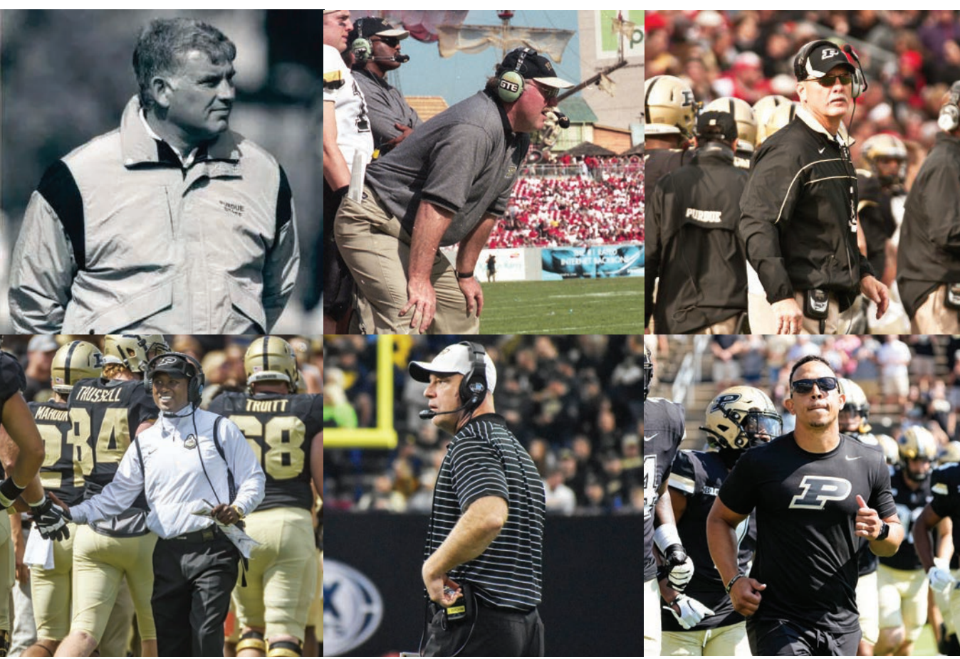
EXPONENT FILE PHOTOS, PHOTO ILLUSTRATION BY SEAN LEVY | PAGE DESIGNER

Six first-year coaches with wildly different 1-1 starts