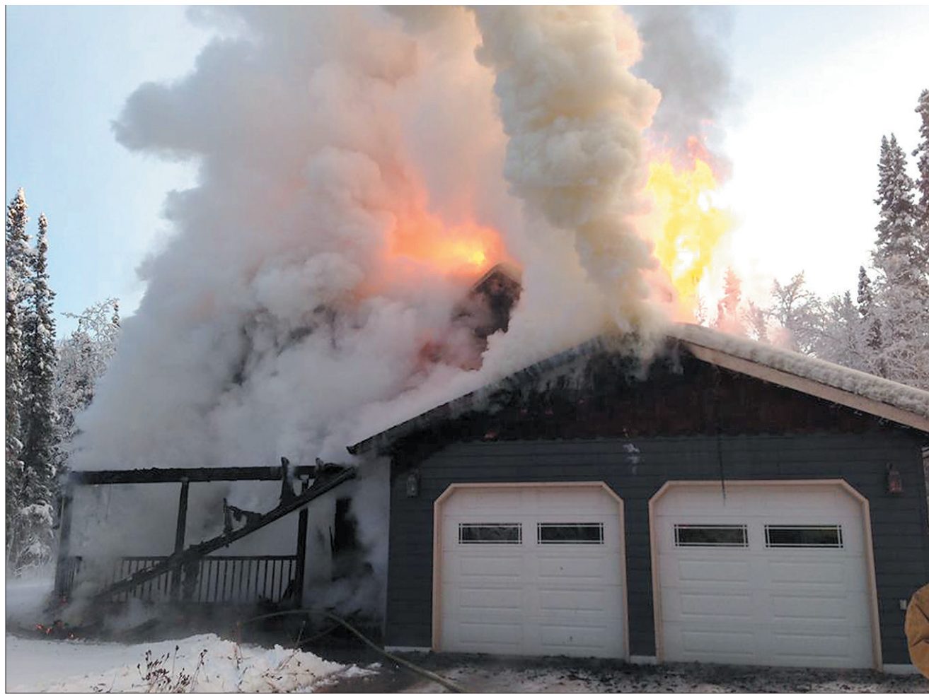
A fire consumes a North Pole area home Thursday.

No people injured, but cat dies in blaze