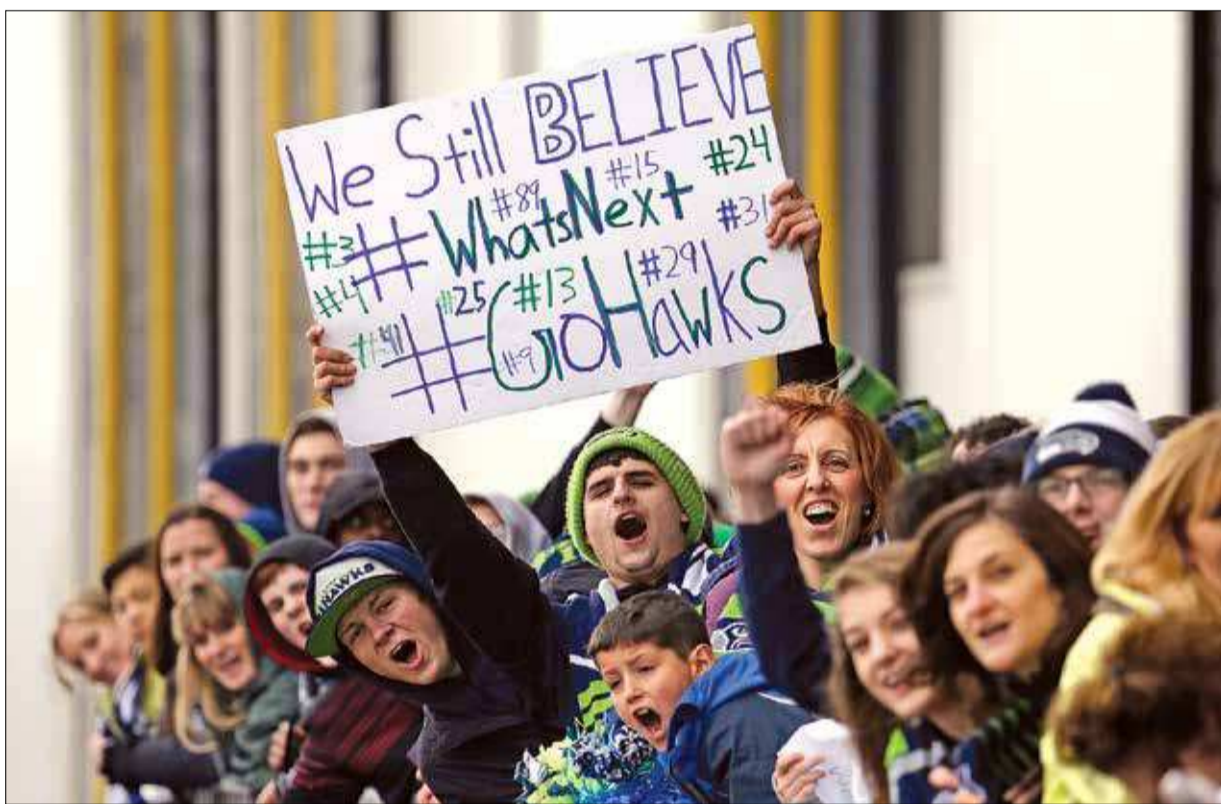
Airline employees and their families cheer the Seattle Seahawks on the team's return from the Super Bowl Monday at Seattle-Tacoma International Airport in SeaTac, Washington. The Seahawks lost the Super Bowl to the New England Patriots on Sunday.