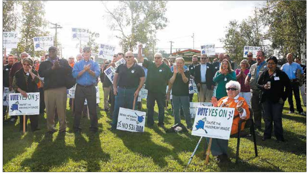
Crowd members react to speakers during a rally in support of raising the minimum wage at Myrtle Park on Thursday.