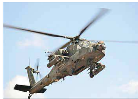
An AH-64 Apache helicopter is seen.

INSIDE Classified » B6 | Comics » A5 | Dear Abby » A4 | Food » B3 | Markets » B5 | Obituaries » A7 | Opinion » A8