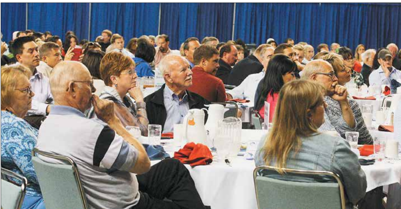
Audience members listen during a candidate forum for U.S. Senate Republican candidates Joe Miller, Mead Treadwell and Dan Sullivan at the Carlson Center on Wednesday.