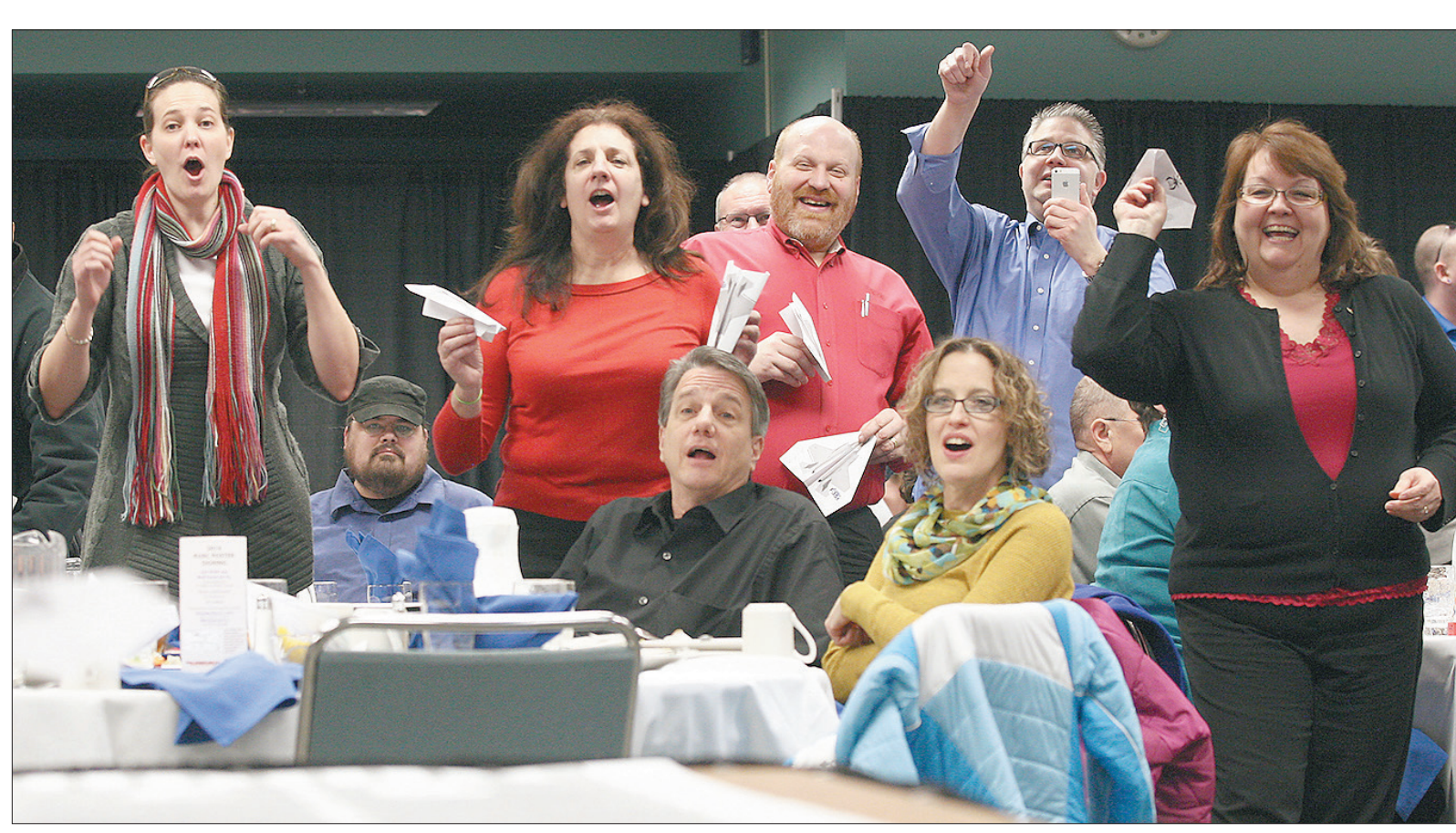
Attendees react to paper F-35 airplanes being thrown toward a tabletop runway during a 50/50 raffle game at the featured presentation "Alaska F-35s: Strategic Reach on American Soil" of the Greater Fairbanks Chamber of Commerce general membership luncheon Tuesday afternoon at the Carlson Center.