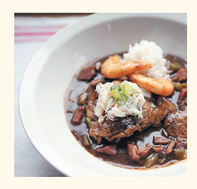
PARTY FARE Mardi Gras dishes