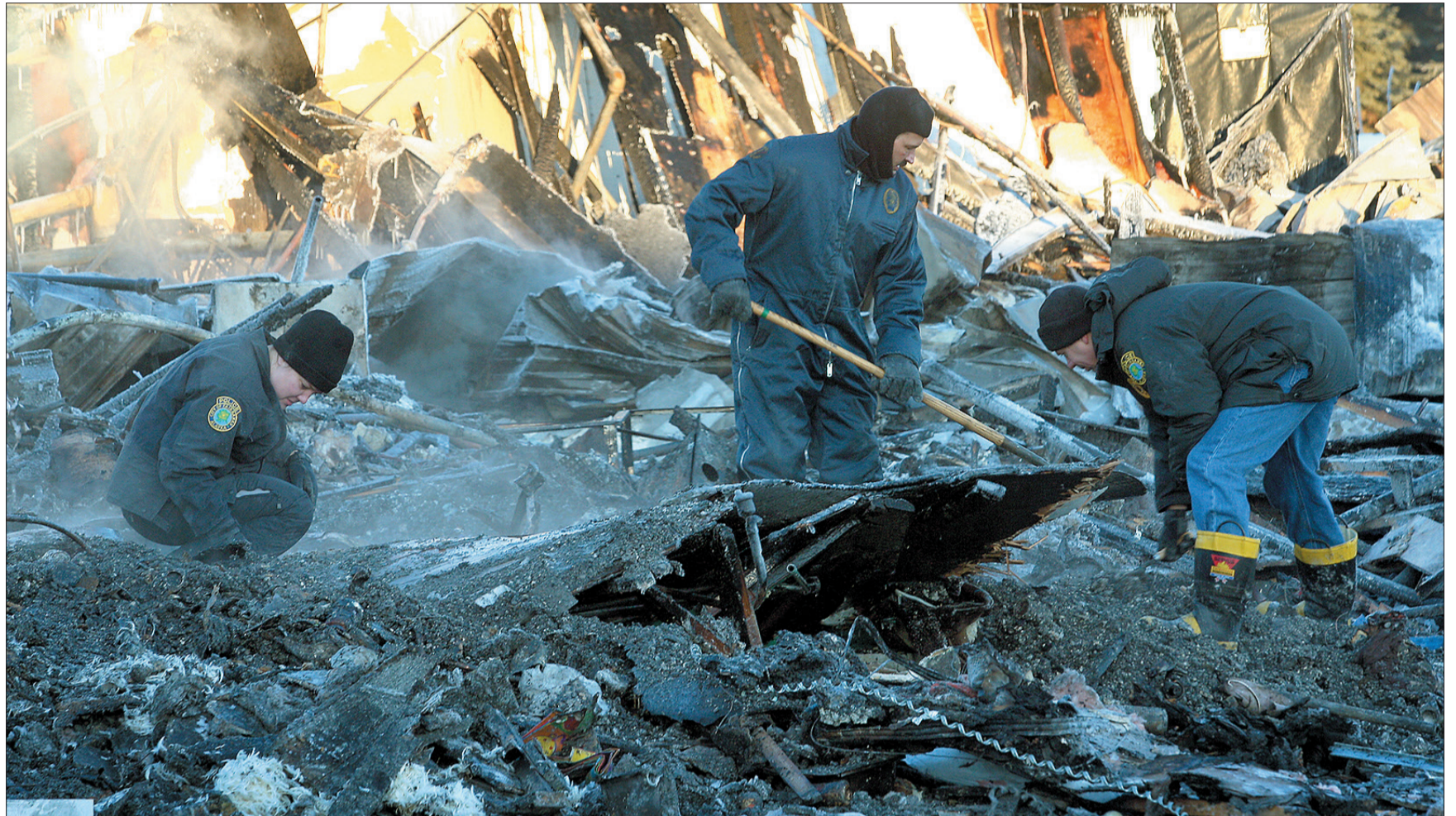
Fairbanks police investigators dig through the rubble of the Geraghty Street fire Thursday afternoon. Investigators found two bodies after the apartment building fire early Wednesday.