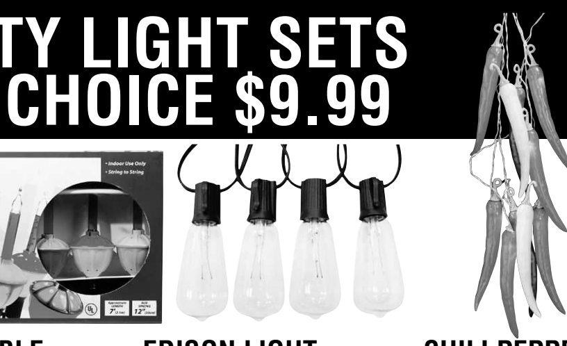
CHILI PEPPER LIGHTS 10CT 9301045