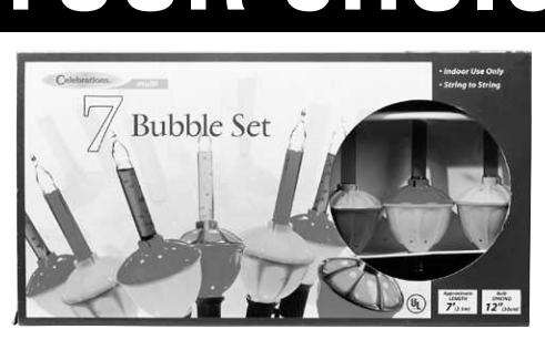
LIGHT BUBBLE EDISON LIGHT C7 MULTI SET 10 CT 9267477