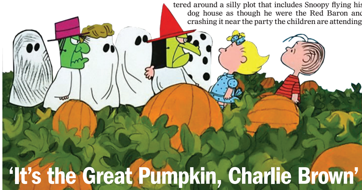
'It's the Great Pumpkin, Charlie Brown'

In this classic Halloween favorite, the jolly children of the Peanuts cast embark on Halloween adventures while Linus and his blue blanket await the arrival of the "Great Pumpkin" in the pumpkin patch near his house. The movie is filled with timeless comedic moments centered around a silly plot that includes Snoopy flying his dog house as though he were the Red Baron and crashing it near the party the children are attending.