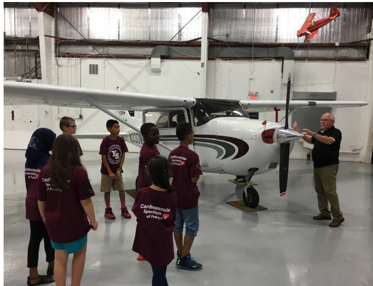
Students learn about flight, tower and simulators at the Aircraft Owners and Pilots Association (AOPA) .

Cardiovascular Specialists of Frederick sponsored t-shirts for the program this year, and Downtown Frederick Partnership provides logistical support of downtown field trips.