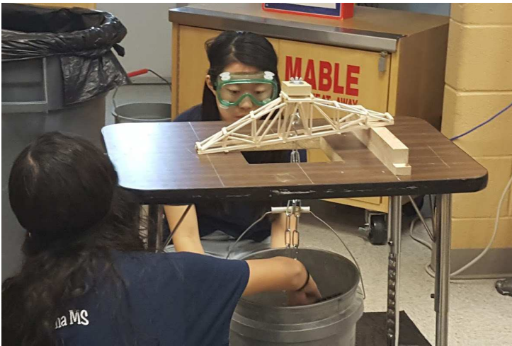
Students test their bridge at the FCPS MSO tournament that BNBI funded.