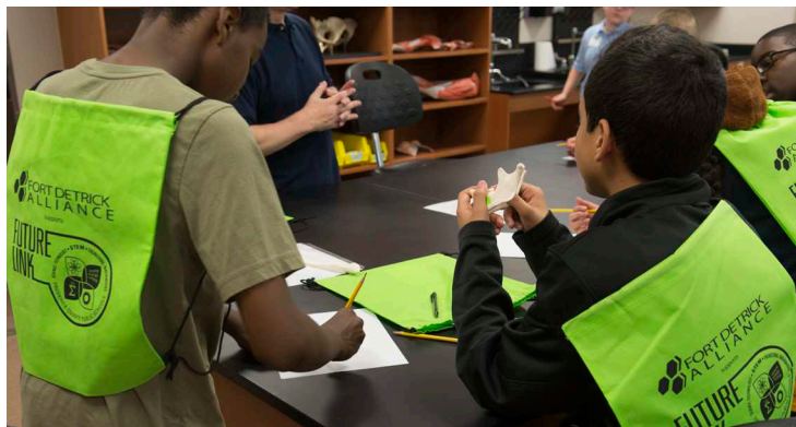
Students learn about bones at Future Link. Thank you to Fort Detrick Alliance for supplying the bags.

professionals helps spark students' interest and enthusiasm for STEM careers and can help guide them in their academic choices. This event highlights the value of effective partnerships with organizations such as Frederick Community College, Frederick County Workforce Services, Fort Detrick Alliance and many local STEM businesses and professionals