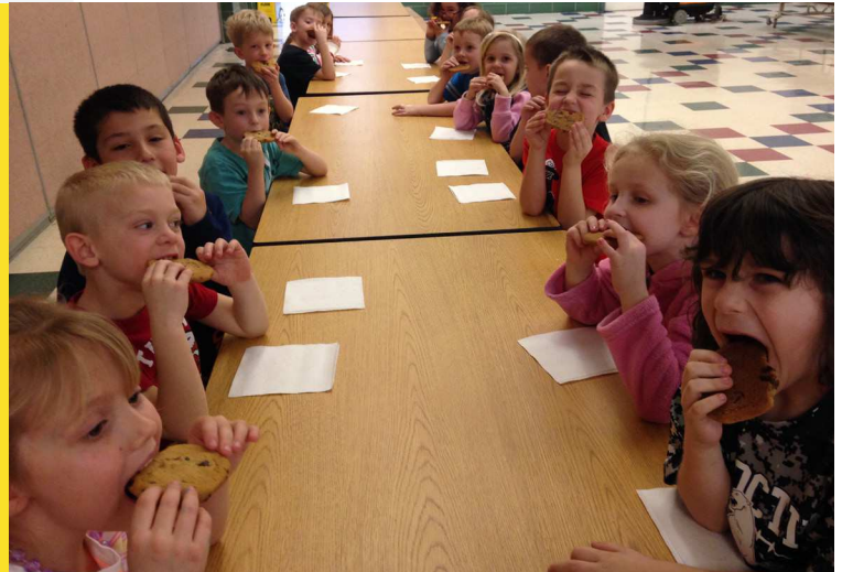
Rocky's Pizza and Thurmont Subway rewarded Thurmont Primary students with pizza and cookies for all their hard work!