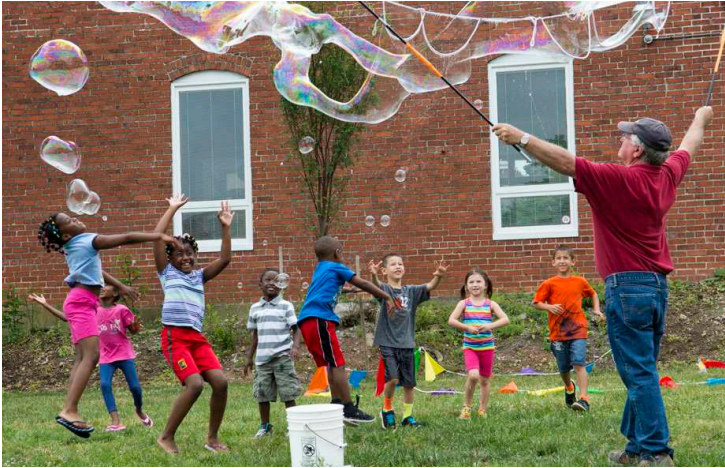
Above: Frederick County Public Libraries hosted Summer Kickoff! Get in the Game! at the Carroll Creek Amphitheater in June to encourage students to read all summer long.

high school to keep them learning and reading all summer long. This is a popular addition to the libraries' Summer Reading Challenge and a great example of the value of cooperation; we work together to create one unified list rather than each school or library creating its own.