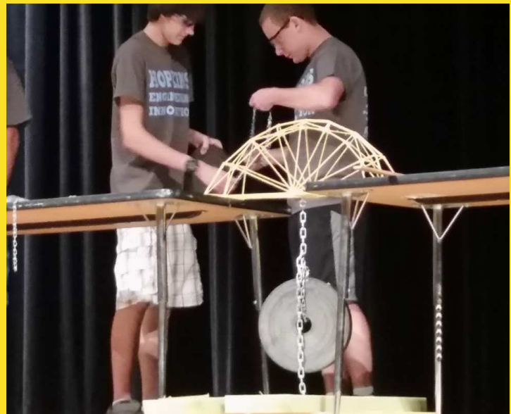
Students test their spaghetti bridges. FCPS partners with Johns Hopkins University to bring Engineering Innovations to Frederick County students over the summer.

FCPS BUSINESS AND EDUCATION PARTNERSHIPS BRING ORGANIZATIONS AND THEIR EMPLOYEES TOGETHER WITH SCHOOLS AND EDUCATORS TO PROVIDE OPPORTUNITIES AND EXPERIENCES EXTENDING BEYOND THE REGULAR CURRICULUM.