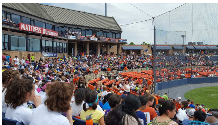
Over 1,000 students attended the 3rd Frederick Keys STEM Day! The Frederick Health Department donated $2,300 to help pay for buses.

The Frederick Keys 6th Grade STEM Day continued for the third year providing FCPS students a fun and educational environment to learn about the relationship between baseball and STEM. Local businesses in the STEM industry such as the Frederick County Health Department, AstraZeneca, Lonza, Nymeo, AOPA, STEMaction, National Institute of Standards and Technology , and Spectra hosted booths for students to explore while completing a STEM and baseball curriculum packet the STEM office developed with support from all FCPS curriculum departments.