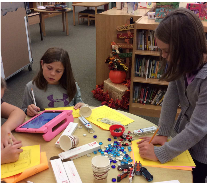
STEM Girls Club at Centerville, CRM grant recipients

ClinicalRM has decided to grow its business in Frederick County. As a token of their commitment to the area, they offer educators a grant in recognition of the important service teachers provide. ClinicalRM believes that the future of our country and its citizens is directly tied to our ability to compete effectively in the global economy. ClinicalRM has awarded $5,000 STEM grants over the last six years to North Frederick Elementary, Parkway Elementary, Walkersville Middle, Ballenger Creek Middle, Centerville Elementary, and this year's recipient Spring Ridge Elementary. The purpose of the grant is to create interest in careers in STEM fields, increase awareness of STEM fields in Frederick County, and increase use of community resources in K-8 schools.