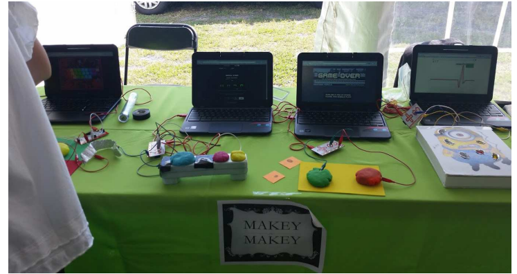
STEM activities at the Great Frederick Fair

Each year FCPS partners with The Great Frederick Fair to bring a variety of fun educational experiences to kids and their families. The FCPS STEM office and Career and Technology Center students provide hands-on activities related to STEM on Kids Day in the Community Tent at The Great Frederick Fair.