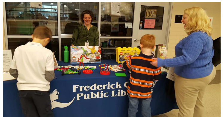
Above: Frederick County Public Library supports FCPS at the Science and Engineering Fair STEM Showcase.