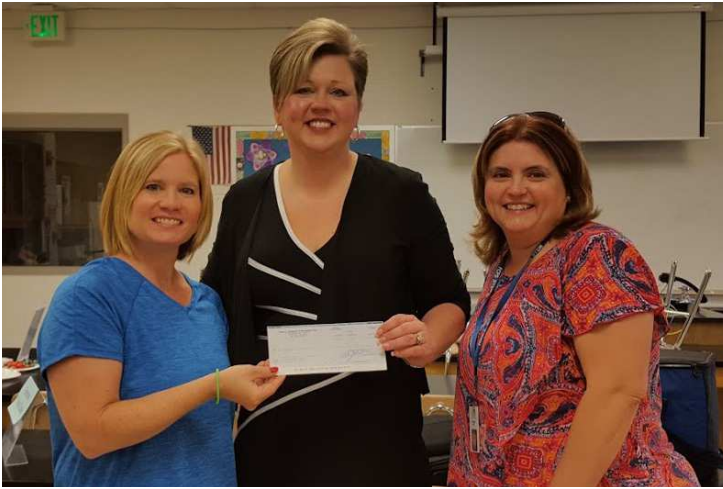
Spring Ridge Elementary staff accepted a $5,000 Clinical Research grant.