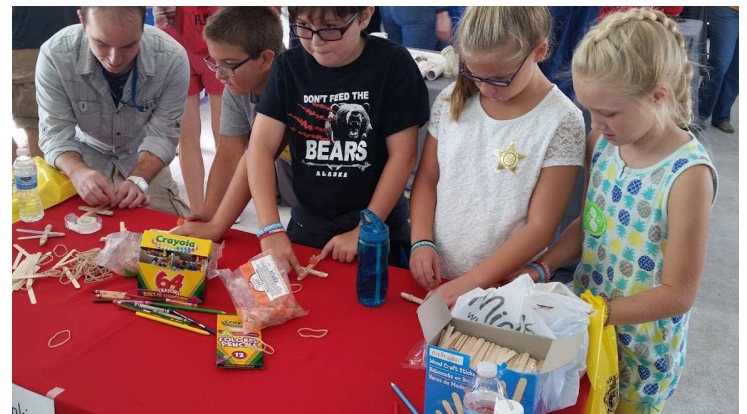
STEM activities are fun and educational at The Great Frederick Fair