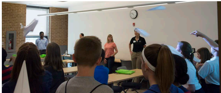
Students learn about aeronautics from Aircraft Owners and Pilots Association staff at Future Link.