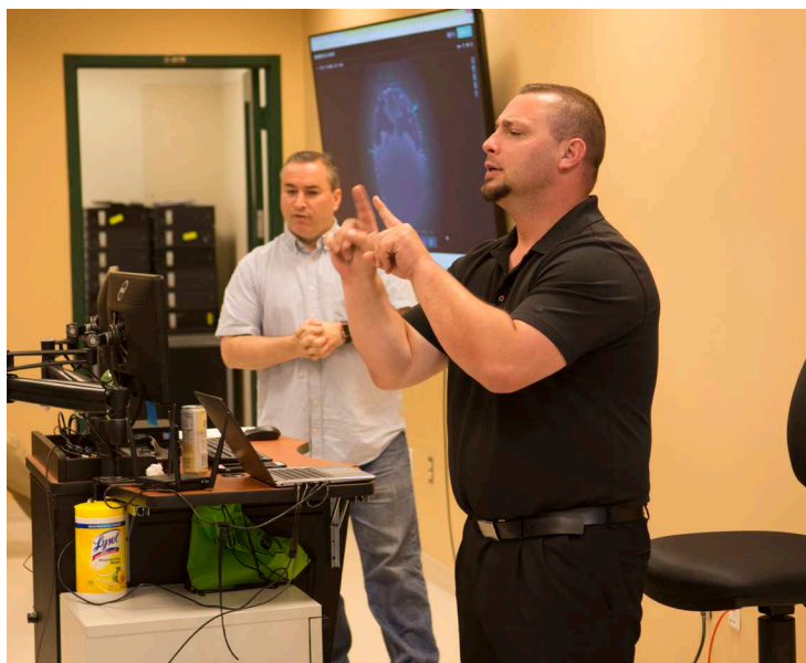
Frederick Community College Cyber Security professors speak at Future Link.

Future Link is an exciting day-long career conference for middle school students held at Frederick Community College. This annual special event provides exposure for over 1,000 talented Frederick County 7th graders to career possibilities in STEM-related fields. Actively engaging with local