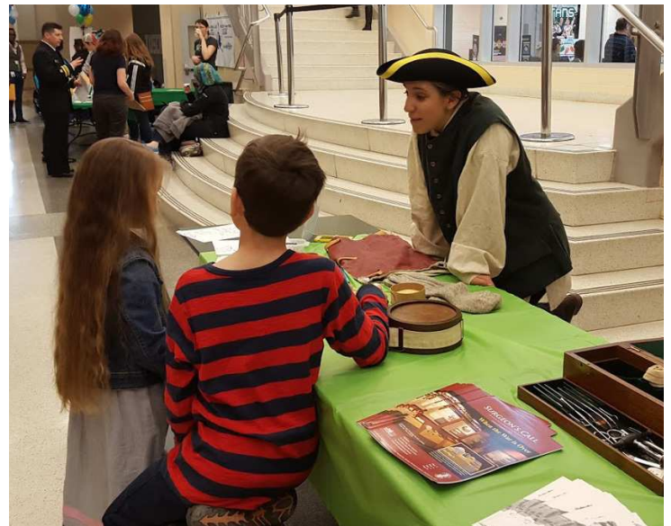
Above: National Museum of Civil War Medicine supports FCPS at the Science and Engineering Fair STEM Showcase.

Maryland Science Olympiads are offered at nine of our middle schools and three high schools. We hold our own tournament and are known around the state as having a strong Maryland Science Olympiad program. Between 450-500 FCPS students system-wide participate and compete at the local and state level each year. We were able to support this year-long extra-curricular activity for students who have a special interest in science, problem solving, creativity and collaboration with the funds from BNBI .