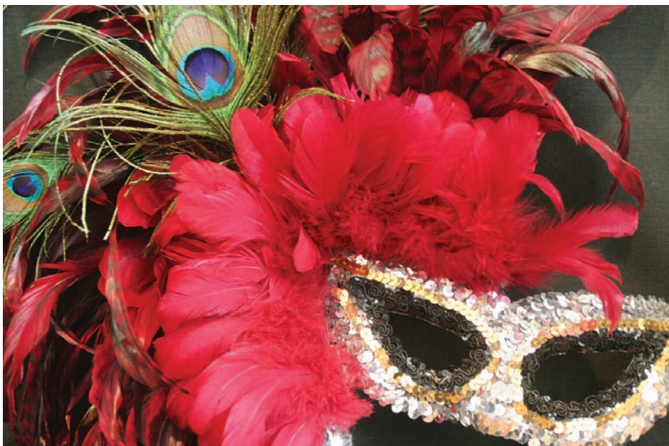
A masquerade theme might be an entertaining theme for a couple's nuptials.